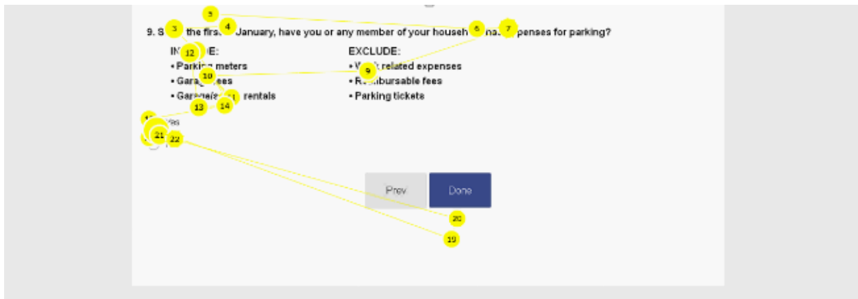
Figure 2. Average Gaze Plot for Double-Banked Include/Exclude Statements

When the instructions were double-banked, the participants typically read through the survey question and then read through the include statements, only glancing at the exclude statements, or sometimes not at all, before selecting their response (Figure 2).