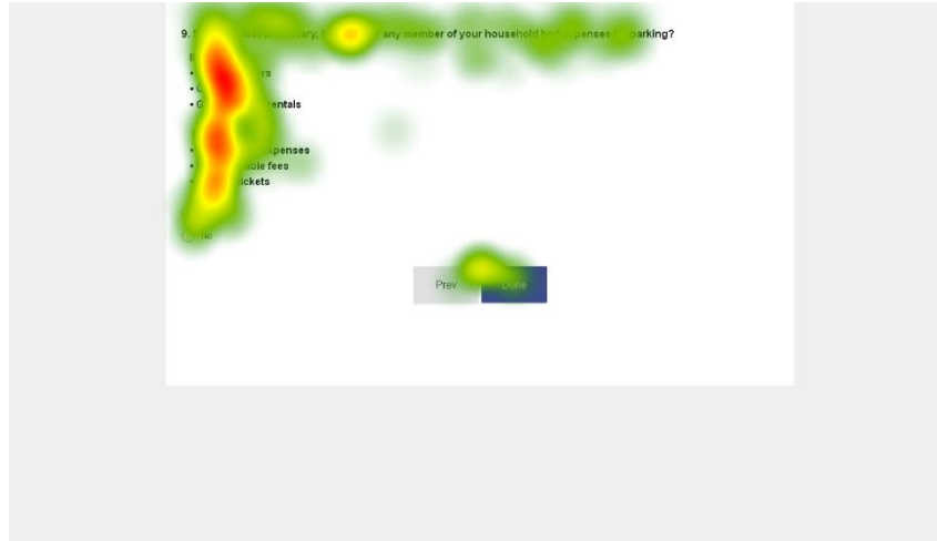
Figure 3. Heat Map for Single-Banked Include/Exclude Statements