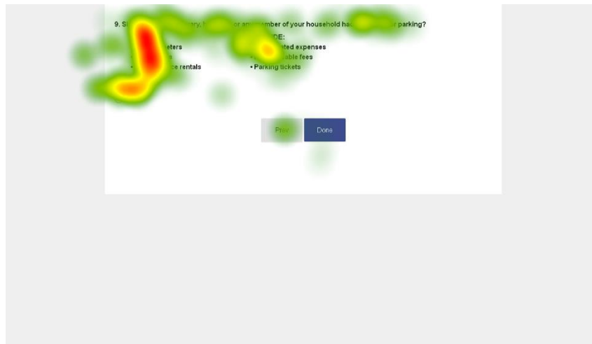
Figure 4. Heat Map for Double-Banked Include/Exclude Statements