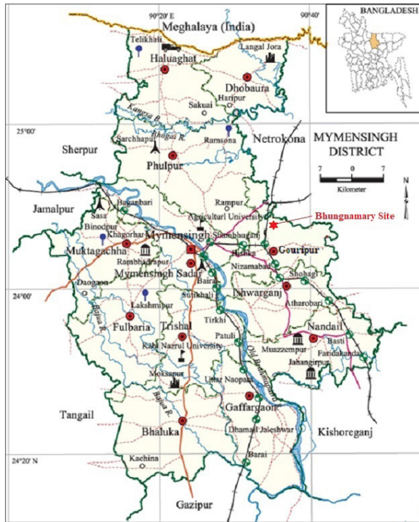
Figure 1. Site of the on-farm experimentations