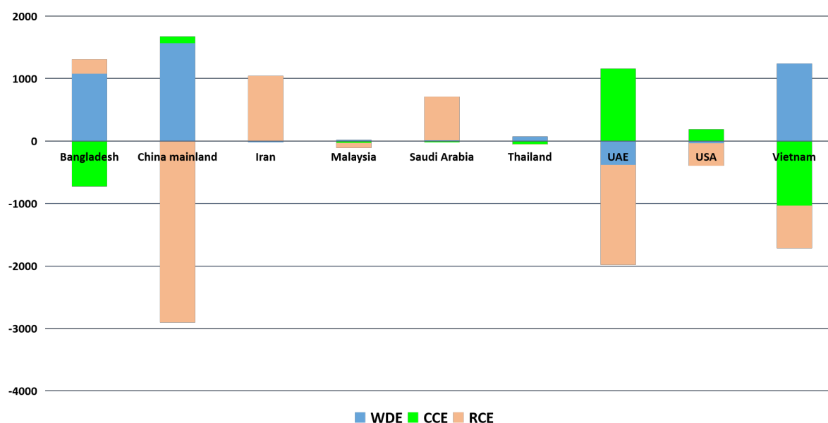
Figure 2. Decomposition of India's total agricultural products exports (US$ Million) across selected countries (2011-2020)