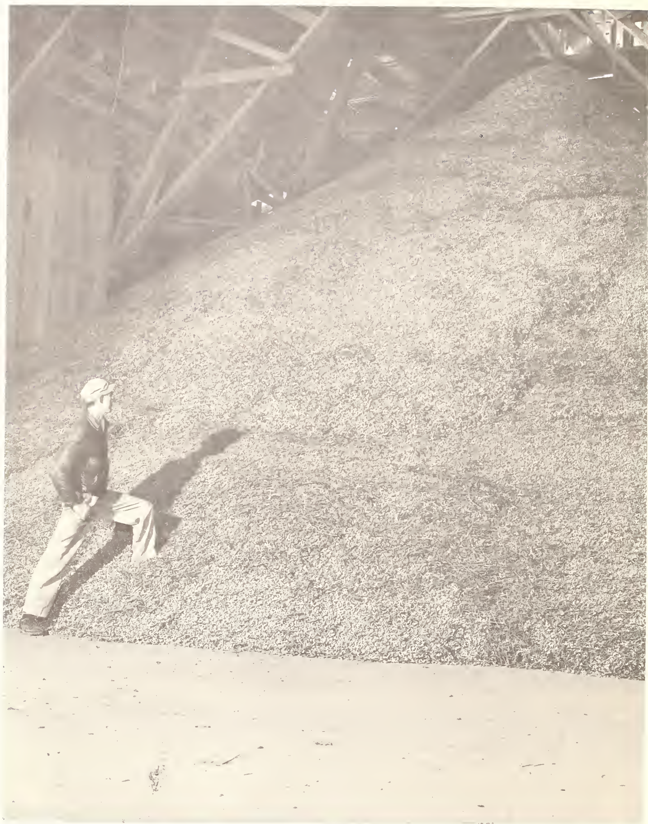
A modern bulk storage peanut warehouse. Bulk storage of farmers' stock peanuts has largely replaced bag storage.