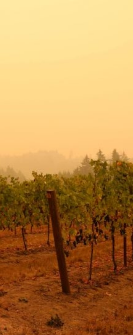
Economic Footprint of CA Wildfires in 2018