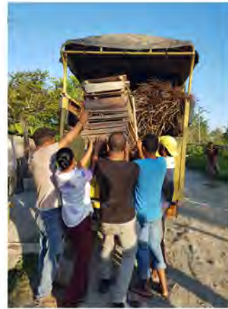
Community members load their pig, worth about USD 600 and roofing materials onto a truck, both to be used in their clan's Uma Lulik (Sacred House) ceremony.