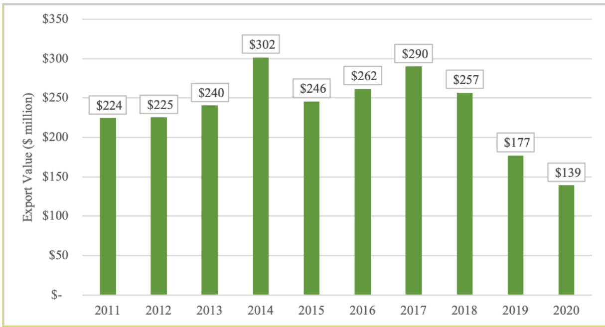
Figure 1. Tennessee Forest Product Exports: 2011-2020.

Source: USDA, Foreign Agricultural Service's Global Agricultural Trade System (GATS)