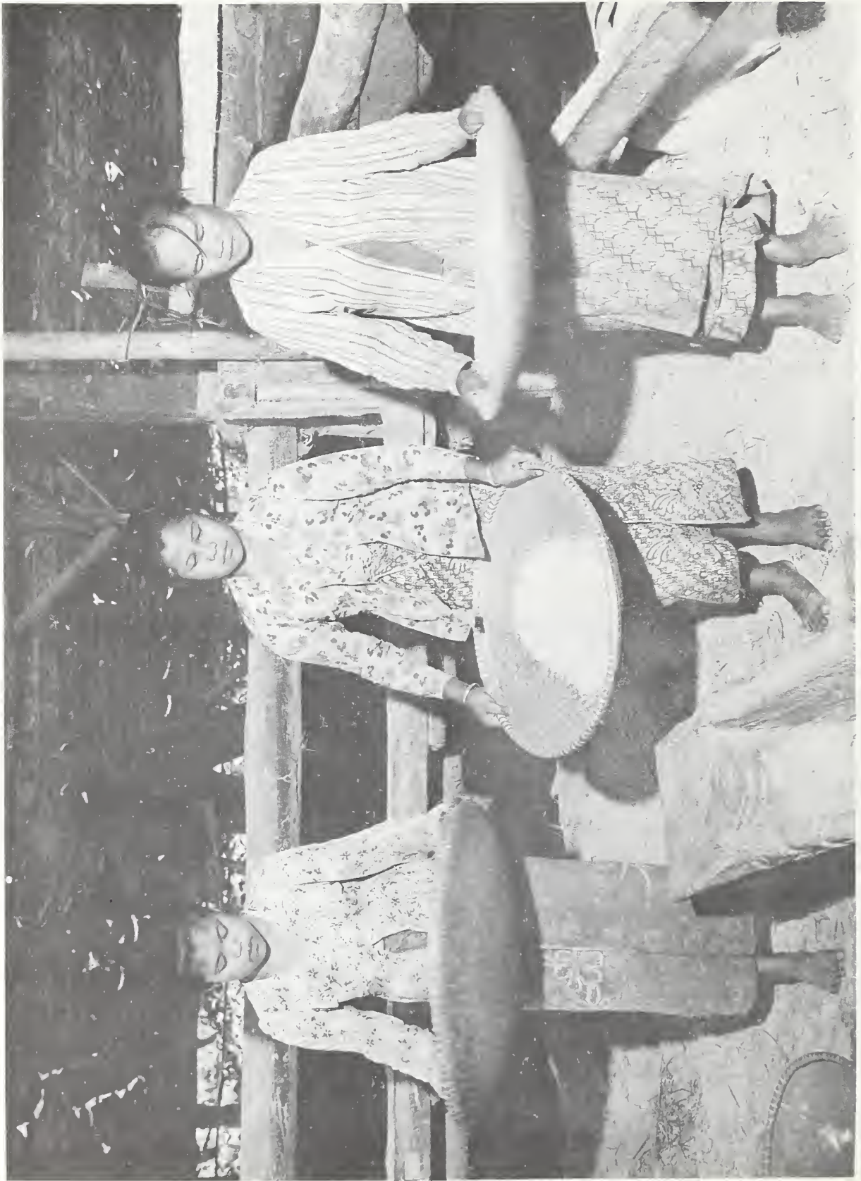
Figure 5.--Rice is winnowed against the wind using flat winnowing baskets woven from bamboo strips.