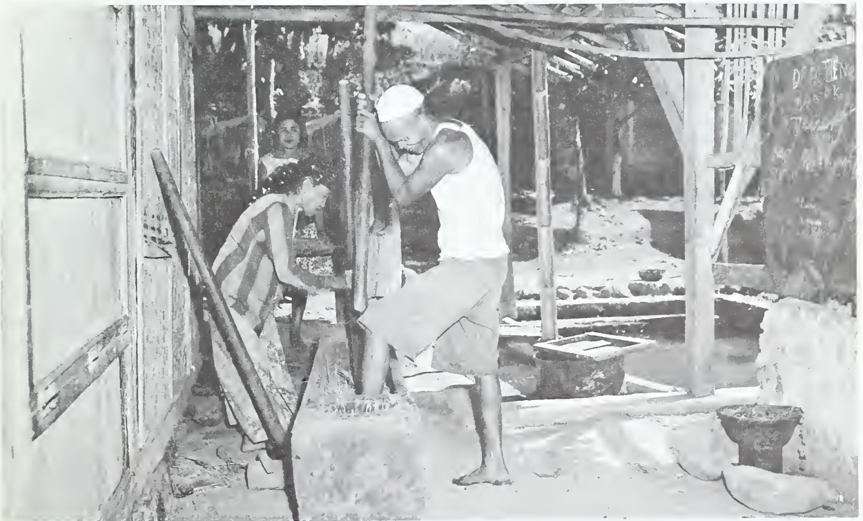
Figure 4.--An Indonesian farmer beats out grain in a dug-out tree trunk with a pestle and his foot.