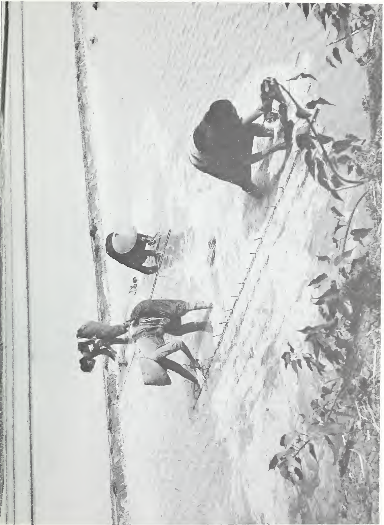
Figure 6.--Transplanting seedlings using marking sticks to guide them along straight rows.