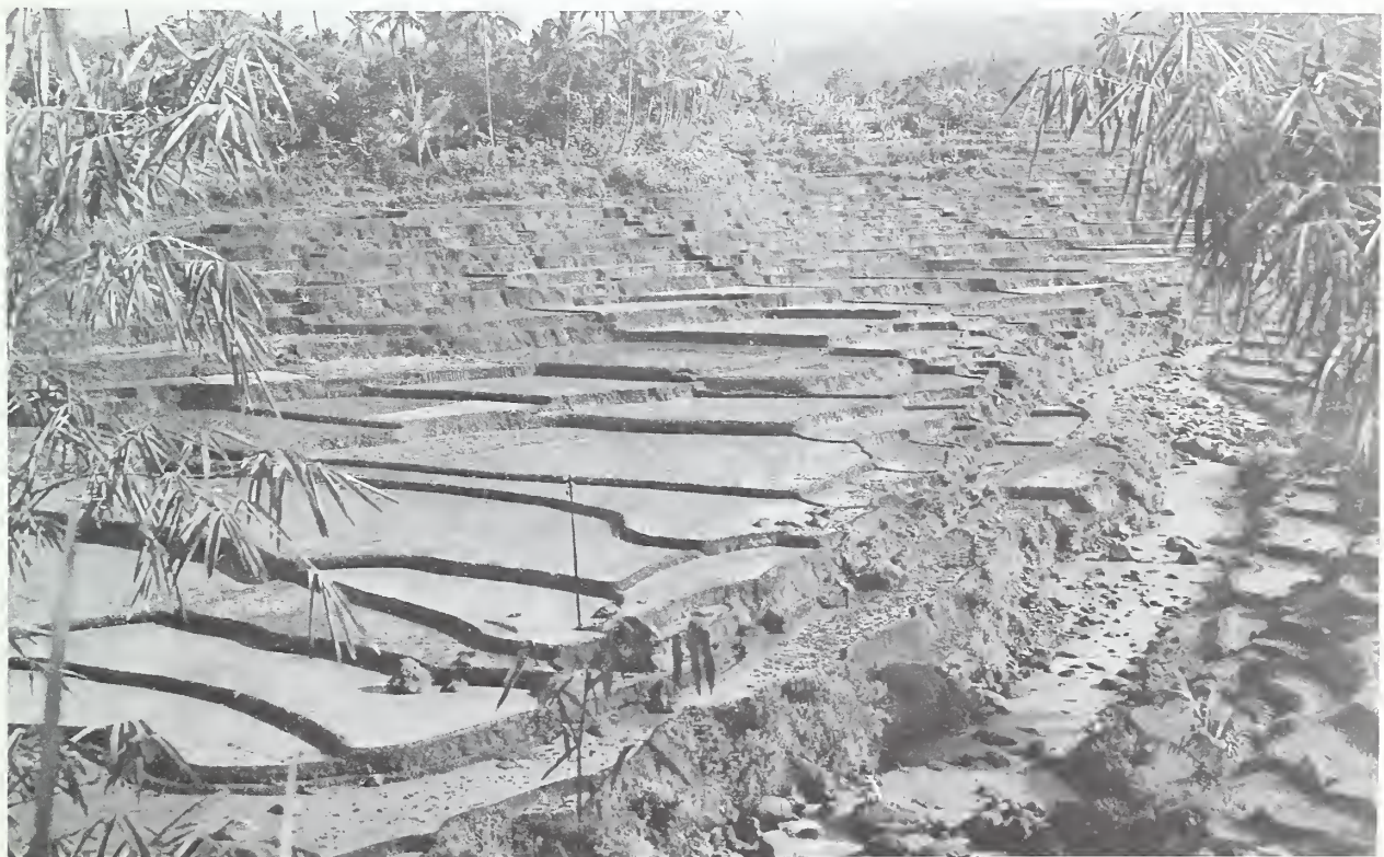
Figure 2.--Irrigated rice terraces of Java.