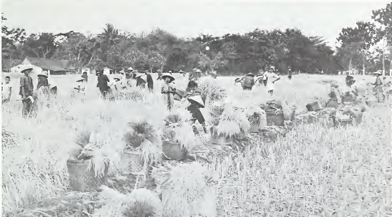
Figure 1.--Krawang in Central Java, a rice-producing center, has a unique harvesting custom which allows a harvester to gather only one basketful from a field. It is believed that if he takes another from the same field, the godmother of good harvest would be displeased and would not grant as bountiful a harvest the next season. Thus more people are needed to do the work--wasting of time and labor