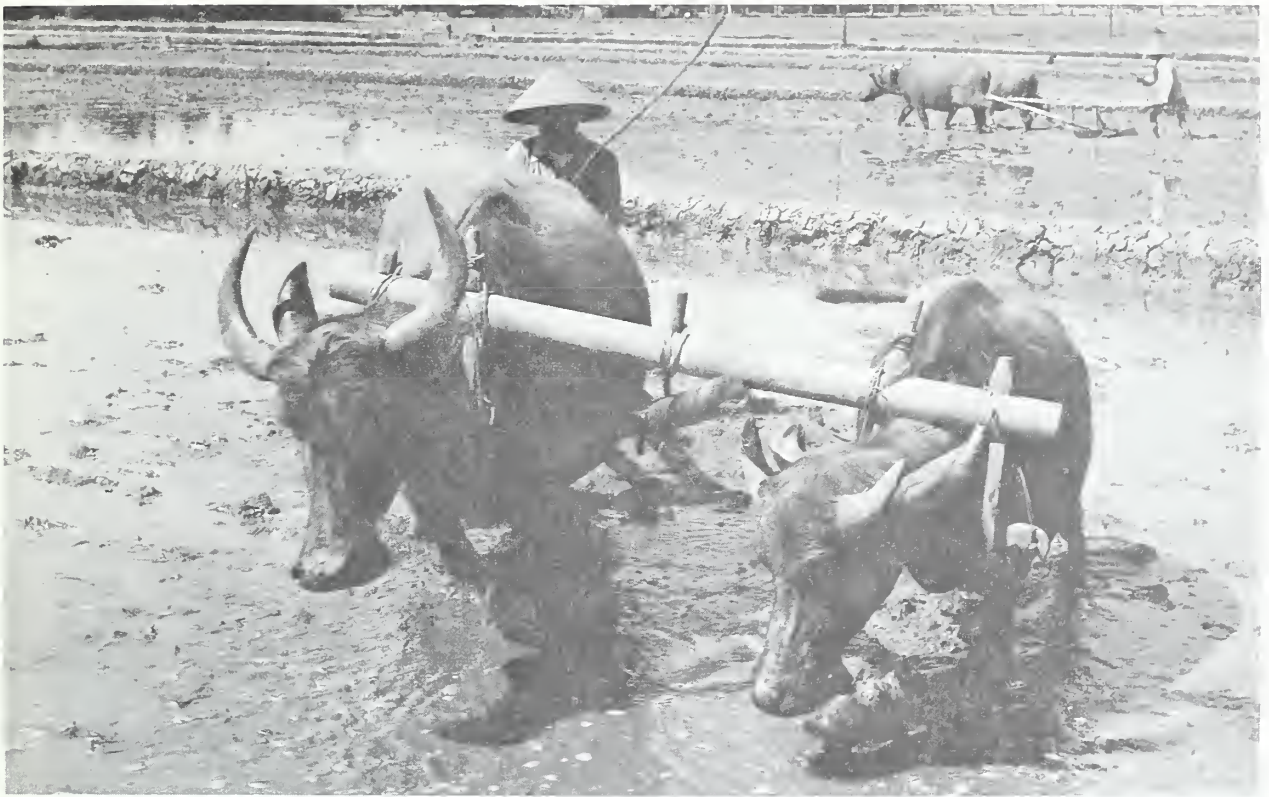
Figure 3.--Cultivating a rice field in Central Java.