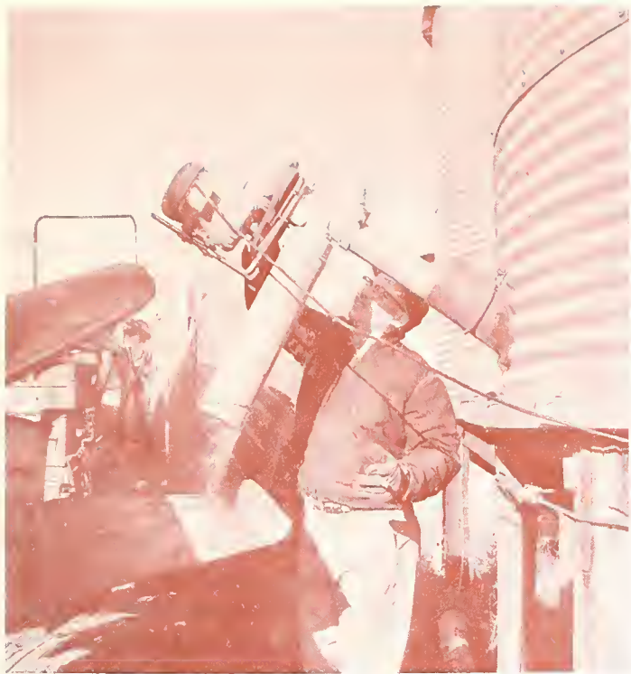
All but one of the members interviewed purchased feed-grain supplements, mostly soybean meal, through their buying groups.

Nearly one-third of those interviewed made all their feed-grain supplement purchases through their buying groups, and an additional one-fourth purchased over half their total