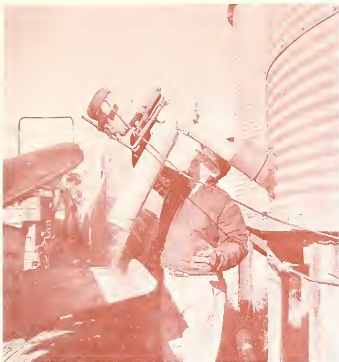
All but one of the members interviewed purchased feed-grain supplements, mostly soybean meal, through their buying groups.

Nearly one-third of those interviewed made all their feed-grain supplement purchases through their buying groups, and an additional one-fourth purchased over half their total