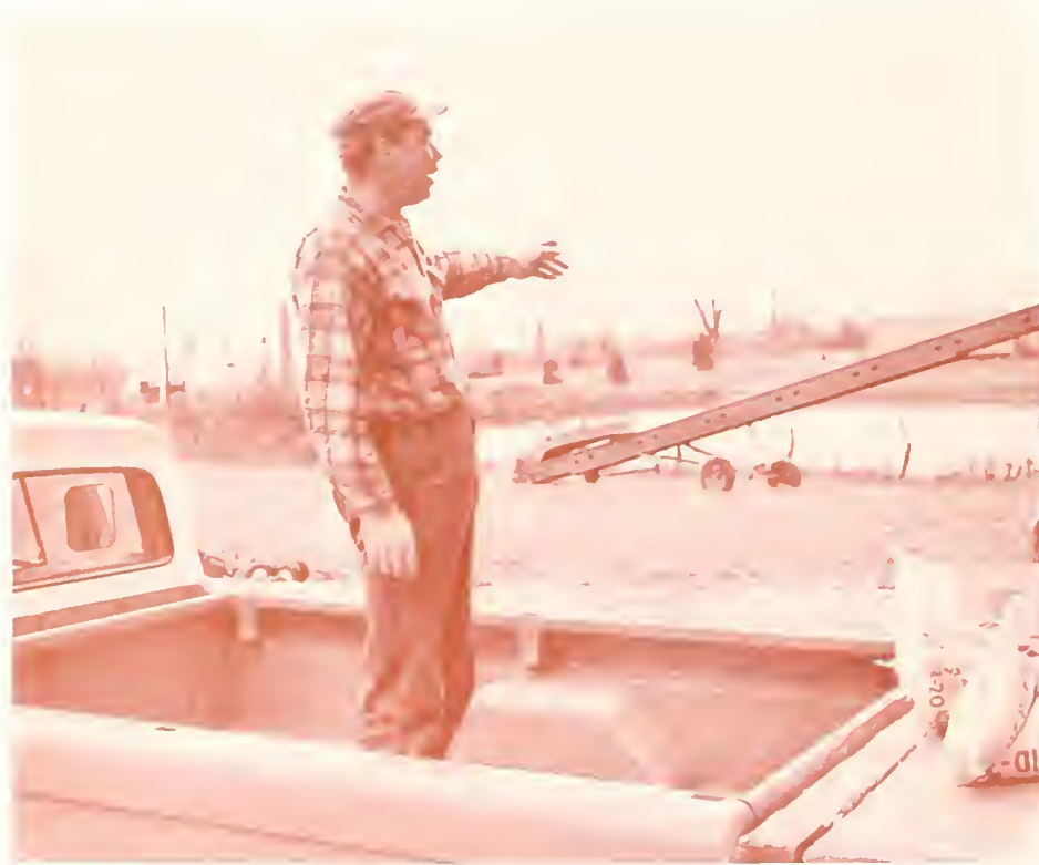
Members of successful buying groups need to be willing to plan and order their needs in advance, to participate in group decisions, and to haul some of their supplies.