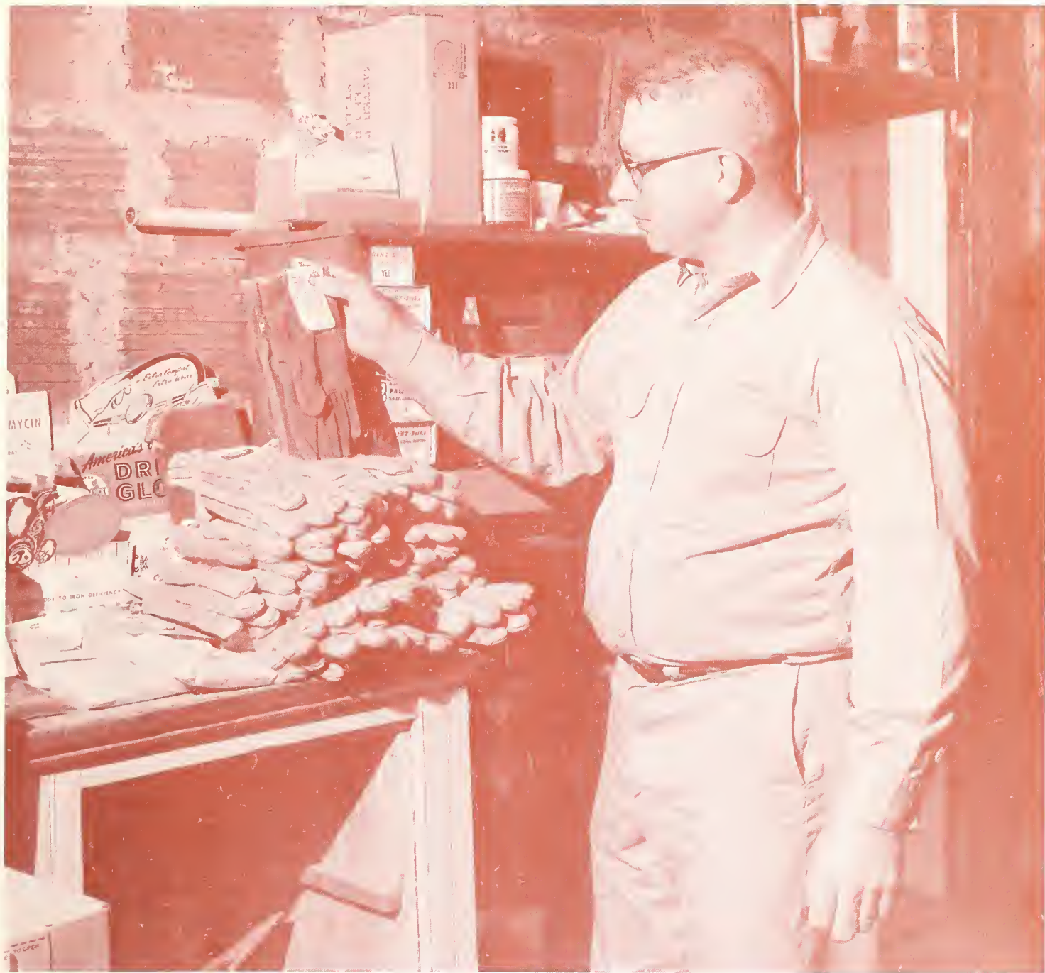
The only inventory of this association is a small stock of supplies in the purchasing agent's basement.

Furthermore, these associations deal in some products which are only used seasonally. Thus, it is possible to determine the quantities needed ahead of time and pool an order to get the price advantage associated with a quantity purchase.