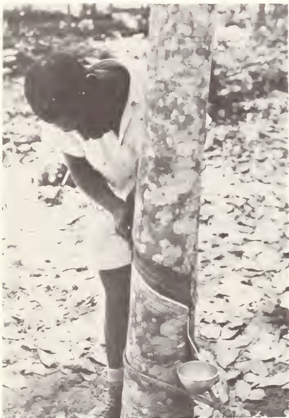
Tapping rubber tree, Belgian Congo.

Third place was filled by cotton (lint, seed, cottonseed oil, and cottonseed cake), with an aggregate value of