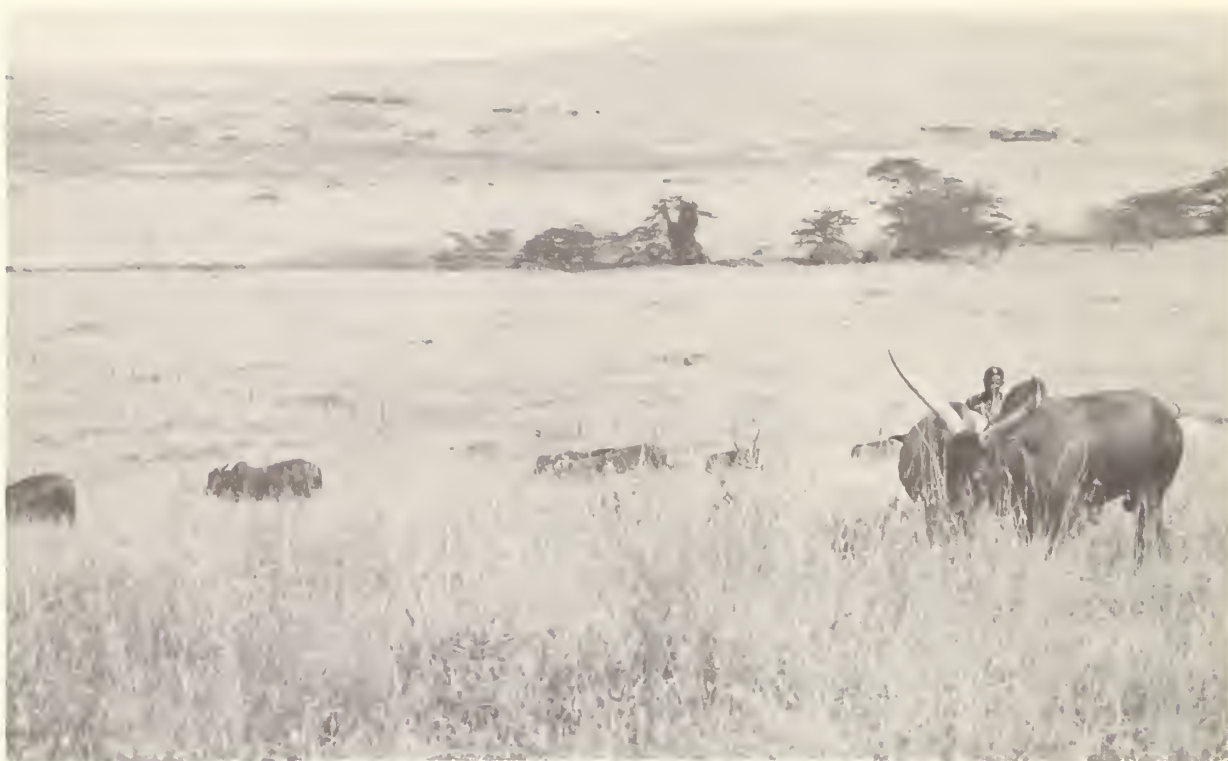
Cattle graze on savanna in Ruanda-Urundi. Here cattle are symbol of prestige and wealth; but in Congo proper, half are commercially important.

The small N'Dama cattle of West Africa have been introduced into Leopoldville Province. They are generally kept in European-managed herds on plantations, missions, and farms and are raised primarily to supply meat to the local population.