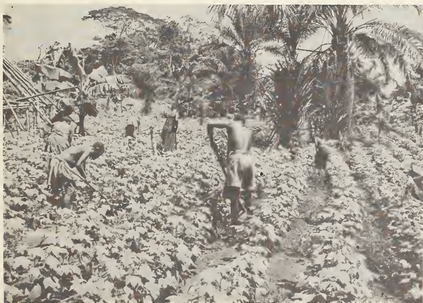
Hoing a field of cotton in government-planned African farm settlement, called a paysannat. All cotton is grown by Africans.

Cotton production in the Belgian Congo and Ruanda-Urundi in 1958 amounted to about 5 percent of Africa's production, or slightly less than one-half of 1 percent of world production. In 1958, about 164,000 short tons of seed cotton were produced on 857,000 acres of land, an average yield of 383 pounds of seed cotton per acre. With a lint turn-out of 34 percent, a total production of 56,000 short tons (equivalent to 233,000 bales of 480 pounds net) of lint cotton is indicated. Production has slowly moved upward over the years. Though in the paysannats the government has recently plowed some cotton land before planting and has applied insecticides by airplane, its policy has been to keep cotton as a crop to be grown only by Africans without much livestock or mechanical workpower. If the new government continues this policy, cotton acreage will probably increase only gradually.