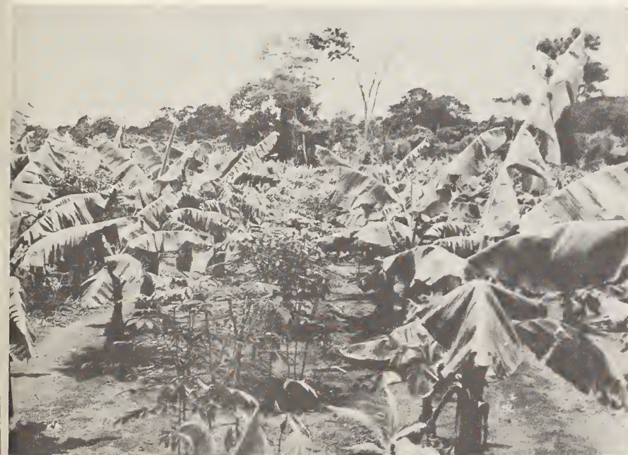
Cassava grows between rows of cooking bananas, or plantains. These are the two most important domestic food crops in the Congo.

Once his land is cleared, the African farmer not in a paysannat breaks and cultivates his land with a short-handled hoe. On some paysannats the government breaks the land with tractor plows, charging the African for this service, and allows him to cultivate his crop with a hoe. On large European-owned plantations, some tractors are used for cultivating. Horses, mules, donkeys, and oxen are rarely used as work animals.