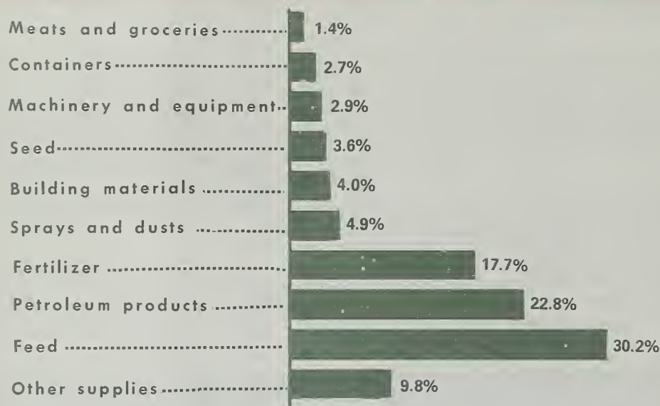
Fig. 4 RELATIVE IMPORTANCE OF MAJOR FARM SUPPLIES HANDLED BY COOPERATIVES, 1971-72

BASED ON NET FARM SUPPLY BUSINESS OF $4.7 BILLION.