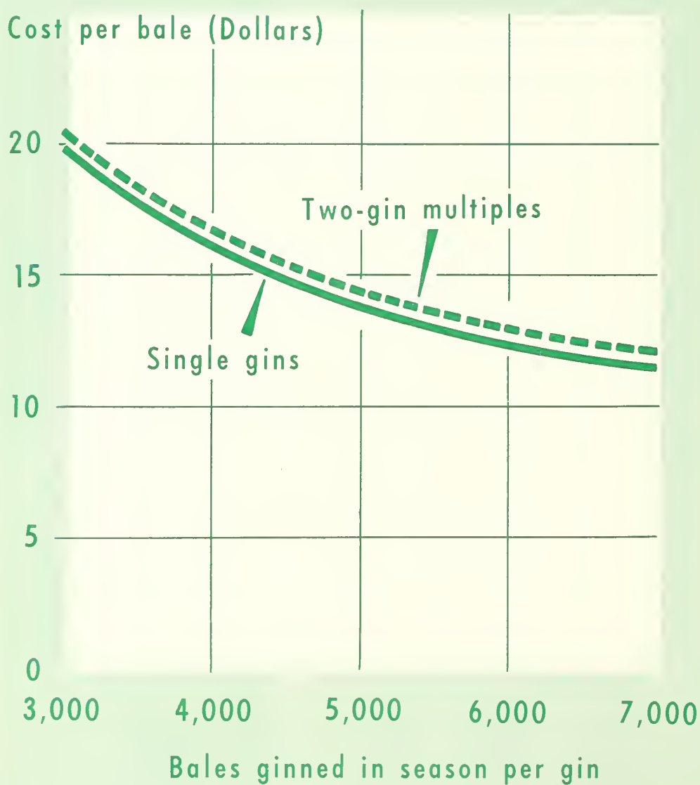
Figure 1. Estimated ginning costs per bale for cooperative gins of 10-bales-an-hour capacity. San Joaquin Valley, California, 1962