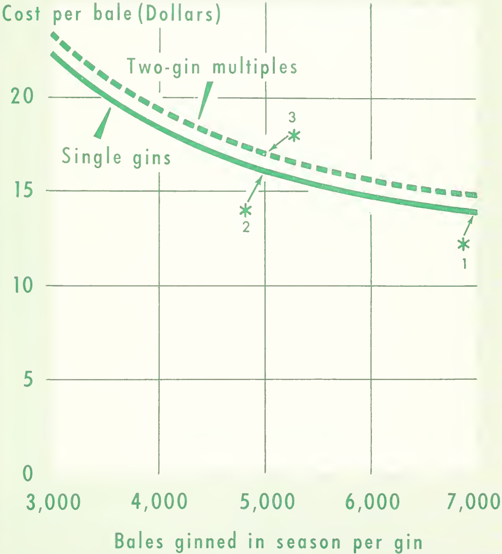
Figure 2. Estimated ginning costs per bale for cooperative gins of 10-bales-an-hour capacity. Lubbock area of Texas, 1962