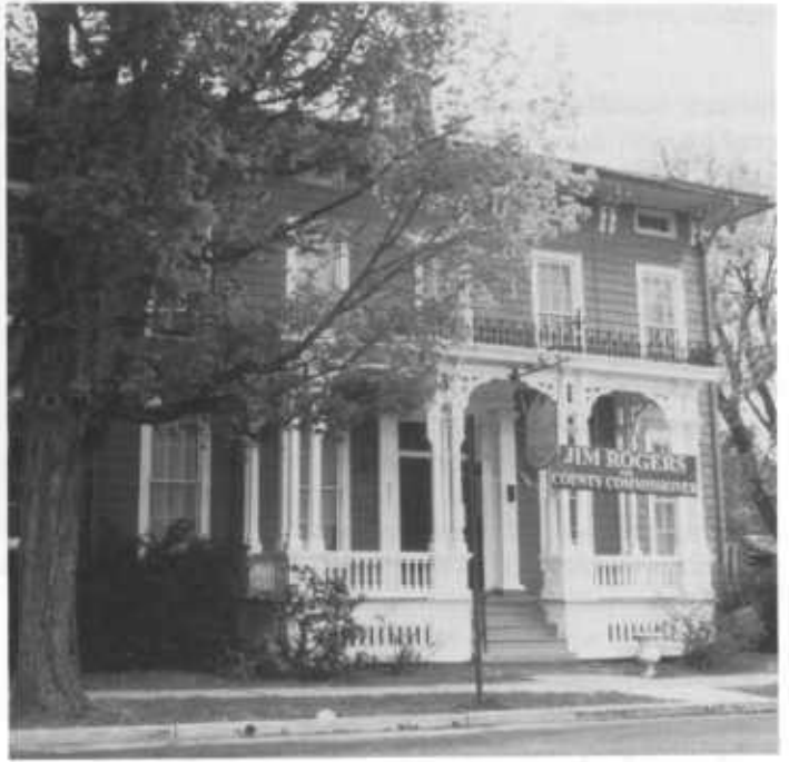
Bed and breakfast inns, such as this one in Lock Haven, PA, are often part of downtown redevelopment efforts.

In 1980, the National Trust for Historic Preservation, building on the experience gained from the Main Street Project, started the Main Street Program and established the National Main Street Center. The center helps and advises communities throughout the Nation in their attempts to conserve and rehabilitate their historic commercial buildings. Although the title implies that they are focused only on the main street of a small community, they focus on a community's entire historic central business district. By 1993, over 850 towns and 35 States were in the program. Communities may join even if their State is not participating.