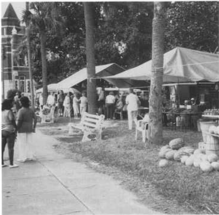
Brunswick, GA, uses a farmers' market to bring people to its historic downtown area.

Purdue University's Community Development Extension Program, in an effort to revitalize small towns' main streets, teams business and education (Schuette). Student interns from the University's fourth year architectural, urban, and regional design courses are hired as unpaid consultants by participating towns to support local efforts at downtown redevelopment.