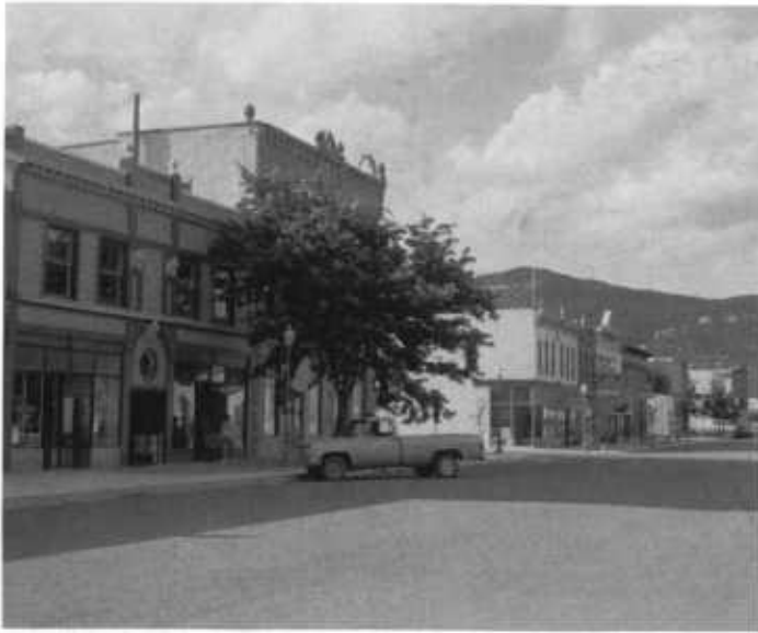
The historic mainstreet by the old train depot in Raton, NM, is coming back to life with many specialty shops.

Measuring the economic effects of historic preservation efforts on main streets poses significant challenges. Data, if available at all, are usually for the entire community or county. Economic activity in downtown historic districts is almost never measured separately from economic activity in adjacent nonhistoric districts, on the outskirts of town, or along main arteries of the community's road system. Analysis, therefore, must rely on observation and interviews.