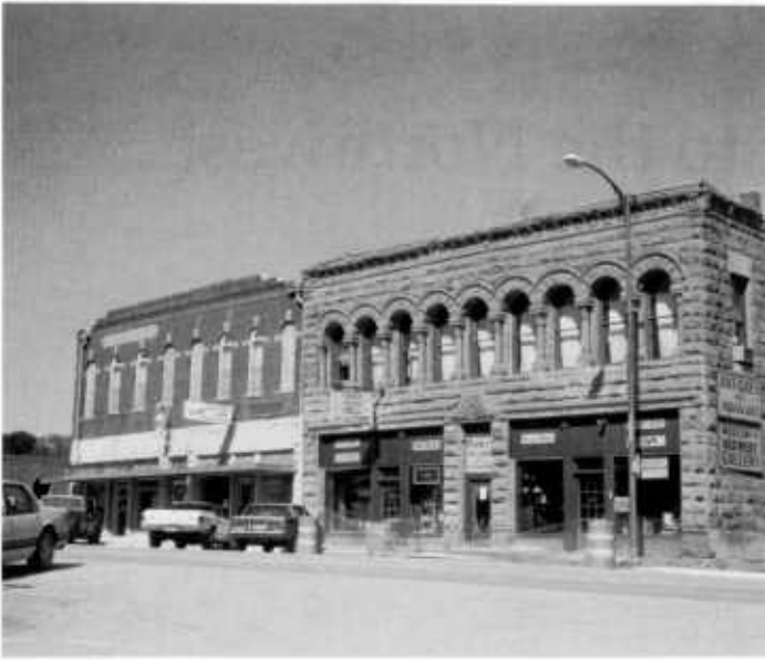
Antique shops and art galleries, such as these in Hot Springs, SD, form an important part of the retail activities in many historic downtowns.

preservation programs can create and sustain growth on their own. Growth depends on historic preservation being part of broader redevelopment efforts and on the climate for growth in the region. However, in several interviews, I found that community leaders felt their communities had gained a sense of identity and pride from their historic preservation efforts, regardless of the amount of growth that followed.