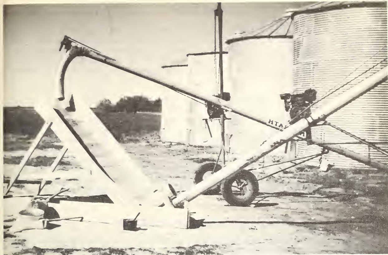
Neg. 5182 (B)