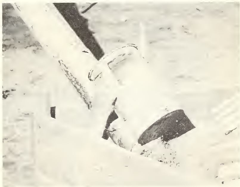
Neg. 5182 (C)