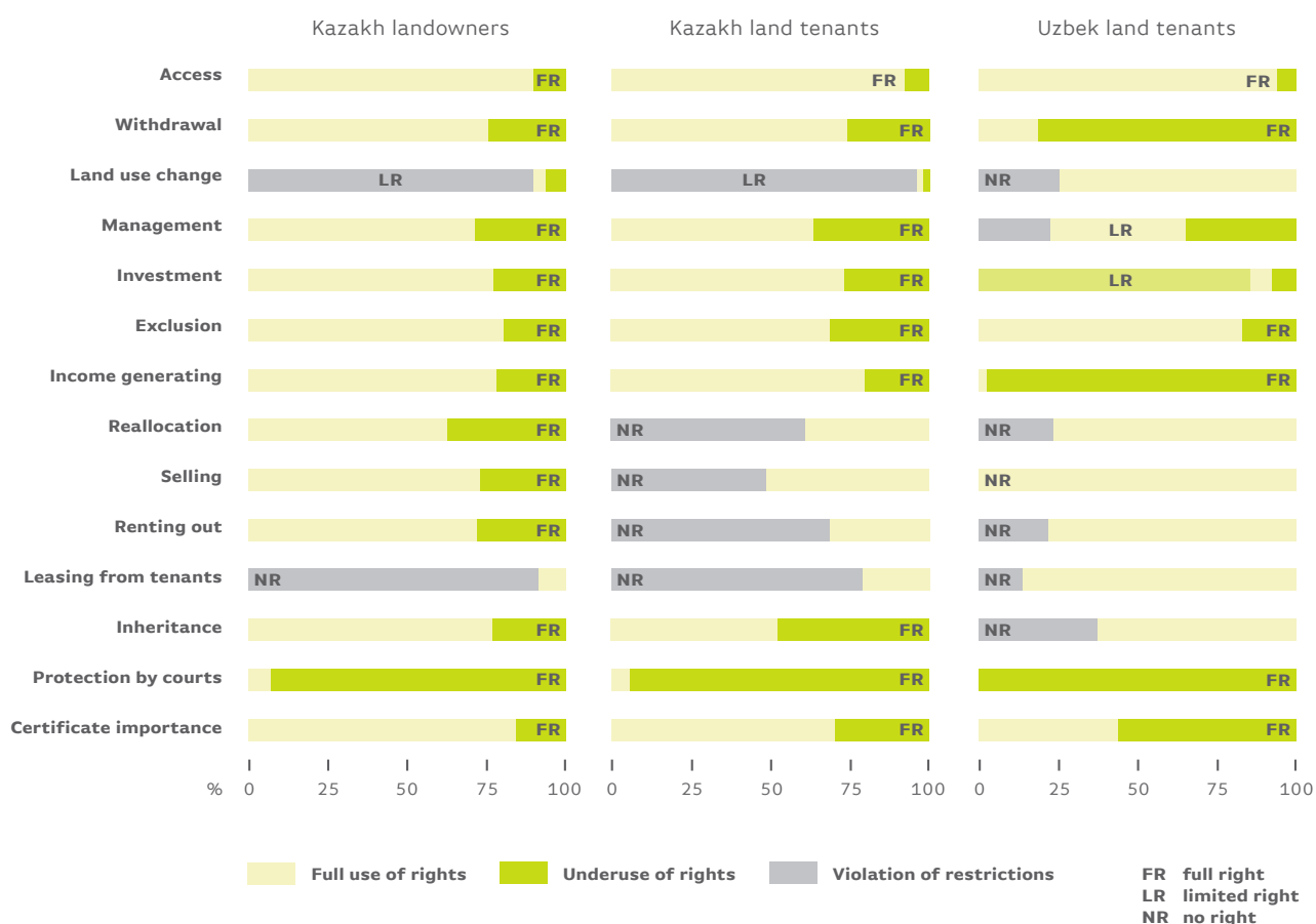
Figure 2: Shares of discrepancies between legal rights and actual practices