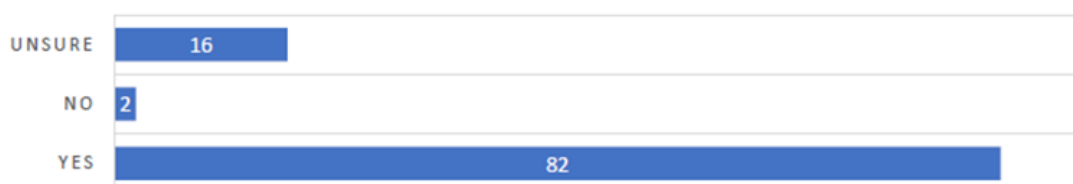
Figure 2. Would You be Willing to adopt agroforestry practices in your cocoa farms?

Almost all the respondents (100 respondents) showed a particularly favourable perception about the role of agroforestry in cocoa production. Members of the communities further showed increased awareness of multiple benefits of agroforestry in cocoa systems. Analysis of the data from the study showed that significant number of research participants (82 out of 100) were willing to plant and integrate trees into their cocoa production systems because of several benefits. These benefits could be broadly categorised into three: (i) local/personal benefits (ii) farm-supportive benefits and (iii) global/microclimate benefits (See fig. 2).