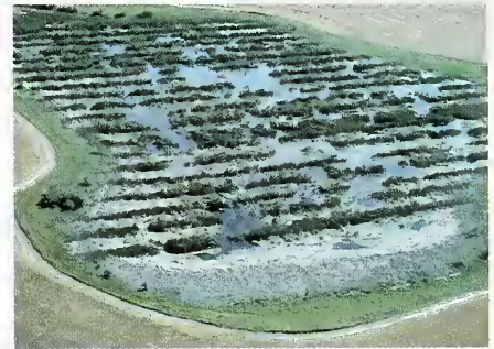
Cattail marshes can be managed using a registered aquatic herbicide to disperse roosting blackbirds.

Cattail marshes used as roost sites for blackbirds can be sprayed with glyphosate (®Rodeo Aquatic Plant Herbicide) to reduce the density of the cattails, which reduction in turn disperses the birds. Rodeo is the only herbicide registered for controlling cattails growing in standing water. (Other herbicides are available for use on cattails growing in marshes without surface water.) Generally, cattails must be treated 1 year