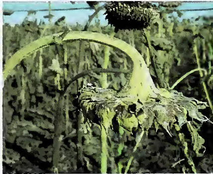
Sunflowers with concave heads, horizontally oriented heads, and long head-to-stem distance appear to suffer less damage from birds than other varieties.

Corn hybrids vary greatly in their susceptibility to bird feeding. Hybrids of corn with long husk extension and thick husks have been shown to be more resistant to damage than other hybrids. Sweet corn is vulnerable to blackbirds for only a few days before harvest and, thus, may be easier to protect than field corn and sunflower.