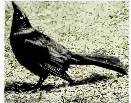
Common grackle (mature male).

Common grackles are slightly larger than robins, with iridescent black feathers and a long keel-shaped tail. The male, slightly larger than the female, has more iridescence on the head and throat. Grackles are common nesters throughout North America east of the Rockies, nesting in shelterbelts, farmyards, marshes, and towns. The male grackle usually mates with one female. Flocks feed in fields, lawns, woodlots,