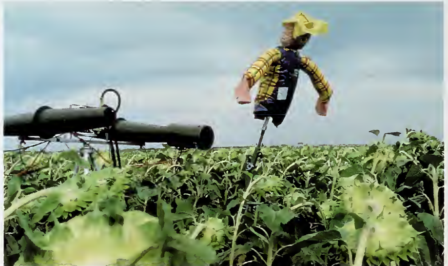
A propane exploder and a popup scarecrow powered by carbon dioxide.

devices mandates that farmers persistently scare the birds before their feeding patterns become well established. Devices need to be employed especially in the early morning and in late