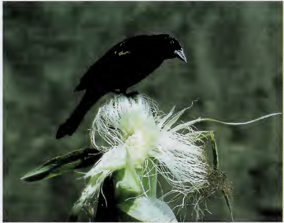
Red-winged blackbird (immature male) on an ear of corn.

Red-winged blackbirds are the most numerous breeding blackbird in the Dakotas and Minnesota and perhaps the most abundant bird in North America. The male, a little smaller than a robin, is black with red and yellow shoulder patches. The brownish female, which is smaller than the male, is often mistaken for a large sparrow. Redwings nest throughout North America in marshes, hayfields, and ditches. Often adult males mate with more than one female. Insects are the dominant food during the nesting season (May–July), with the diet shifting to predominantly grain crops and weed seeds in late summer through winter. Redwings from the Dakotas and Minnesota migrate to the lower Great Plains and gulf coast region in winter.