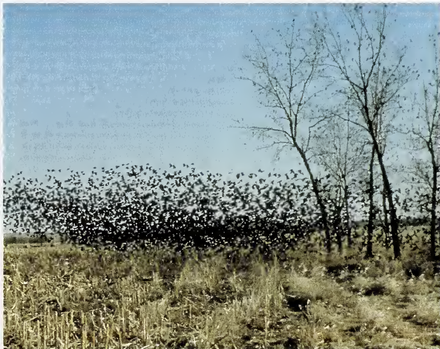
Blackbirds often use alternate feeding sites when available.

In late summer, after the nesting season, blackbirds form flocks and roost at night in numbers varying from a few to over a million birds. These flocks and roosting congregations are sometimes comprised of a single species, but often all three species mix together. Although some blackbirds roost in trees in the northern Great Plains, the birds prefer to roost in dense cattail marshes. Between 40 and 50 percent of the blackbird population dies every year. But these mortality figures are offset by the birds'