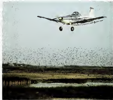
Airplanes can be used to scare blackbirds.

Harassing feeding blackbirds with an airplane can sometimes be an effective method of chasing flocks from sunflower fields. This technique appears to be most effective if combined with other mechanical methods on the ground, such as shotguns or pyrotechnics.