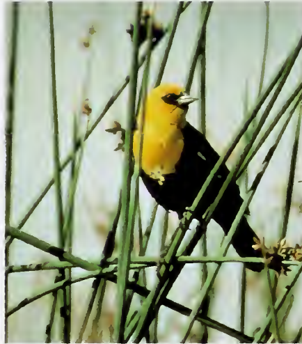
Yellow-headed blackbird (mature male).

A robin-sized bird, the male yellowhead has a black body with a conspicuous yellow head and breast and a white wing patch seen only when the bird is in flight. The female is smaller and browner with yellow throat and breast and does not have a white wing patch. Yellowheads are locally abundant nesters in deep-water marshes of the northern Great Plains and western North America. Like redwings, male yellowheads often mate with more than one female. This species feeds extensively on insects during the nesting season and in late summer and fall on weed