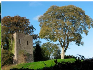
Table 3. Least Preferred Landscapes (photo numbers correspond to ranks in Table A1).

6. Large tree next to castle ruin in field