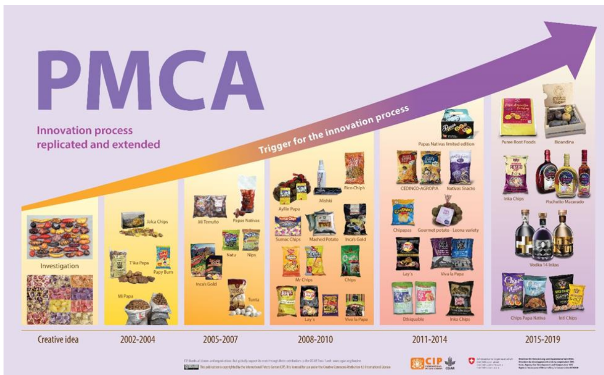
Figure 2. PMCA's Influence on Innovation in New Potato Products in Peru

The experience in Peru was mirrored by the public and private sectors in Ecuador. CIP, the private company INALPROCES, the national agriculture research institute (INIAP), and the farmer organization CONPAPA collaborated to develop market opportunities based on the country's wealth of native potato varieties (Devaux et