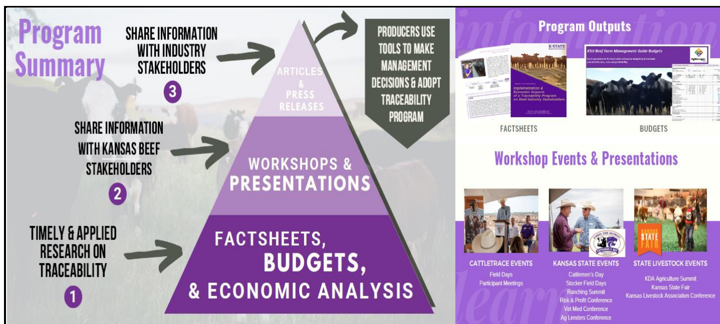
Figure 2. CattleTrace Extension Program Summary Diagram (Including program outputs, resources, and events)

Kansas State Stocker Field Days, and the Ranching Summit. 1,3