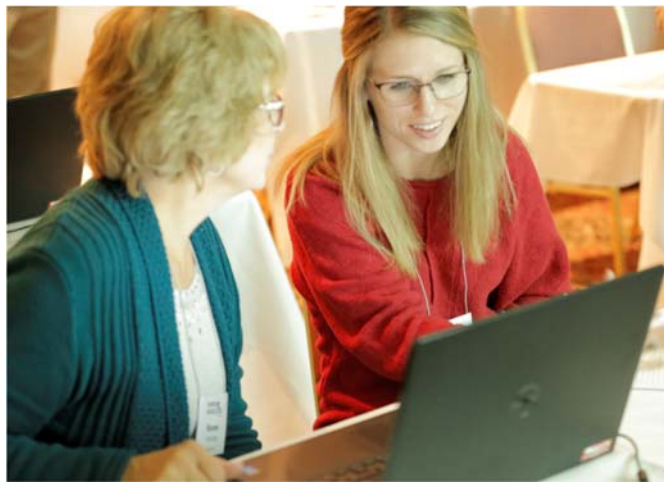
Participants work together on to build a farm in Quicken, a personal financial software, during a 2018 workshop

The 2019 Nebraska Women in Agriculture Conference is scheduled for Feb. 21-22, 2019 at the Kearney Holiday Inn Convention Center.