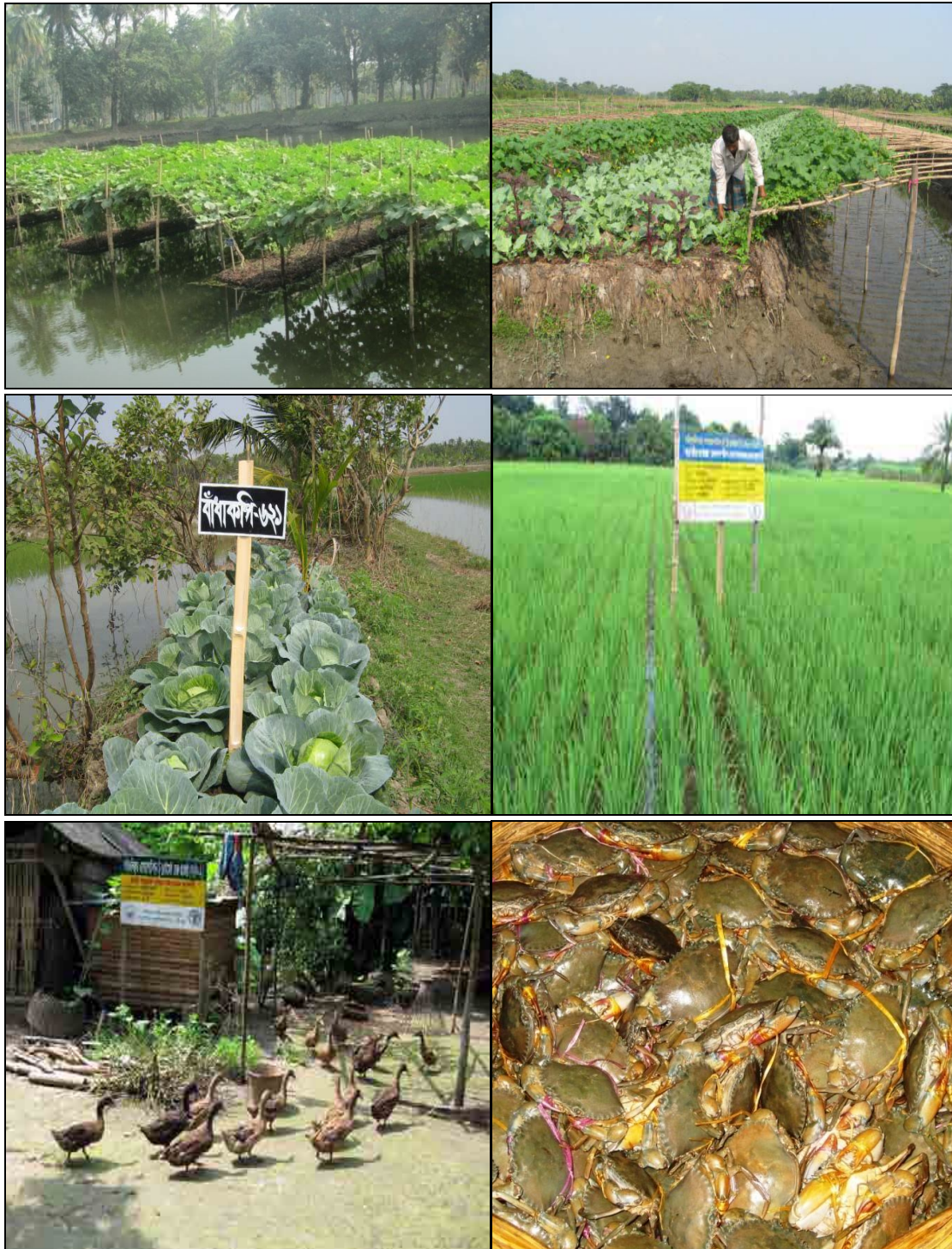
Fig. 2. Practices of some community-based adaptation options: Vegetable cultivation by floating dhap 2 technique(a), and sarjan method (b). Cropping on shrimp farm embankment (c) and saline resistant rice varieties (d). Duck rearing (e) and crab fattening (f) as alternative sources of income.