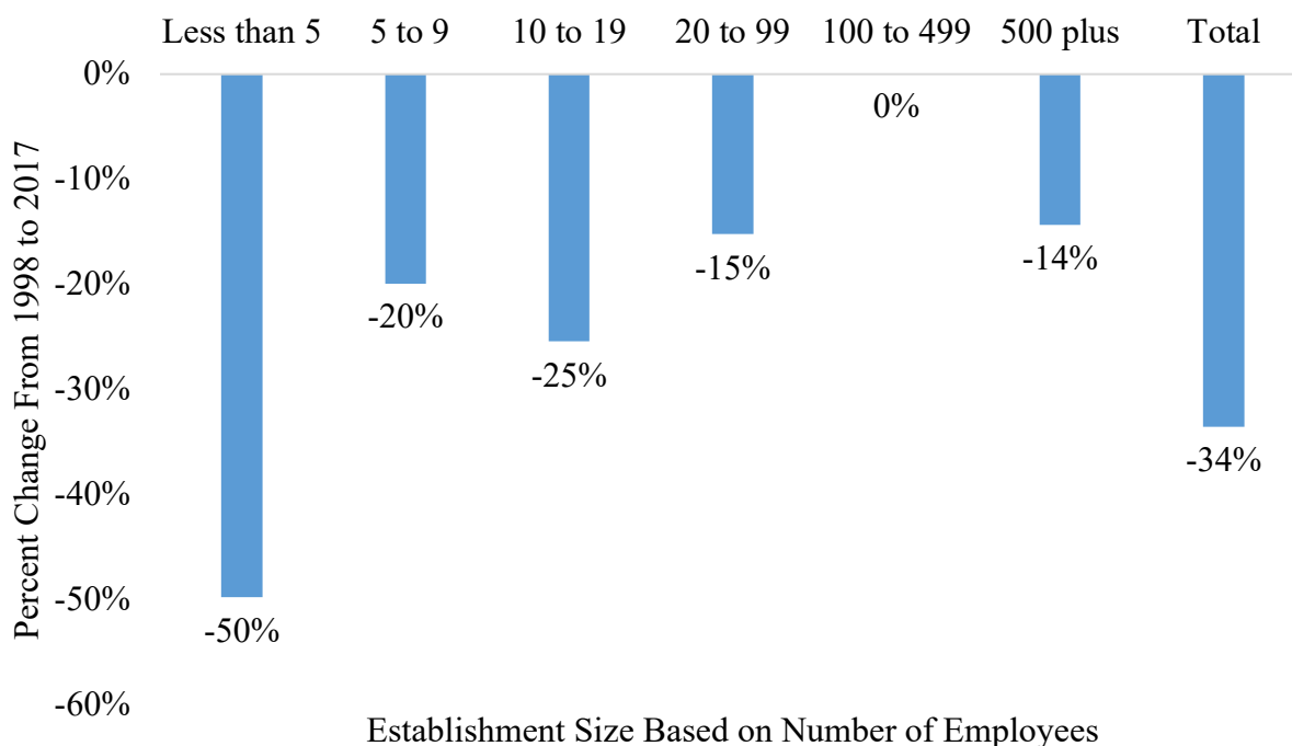
Figure 3. Change in the Number of Establishments by Employment Class for Large Animal Slaughter Facilities From 1998 to 2017.

3). These data indicate economies of scale in the packing industry are important. However, some small-scale slaughtering facilities have remained in operation during this time period, implying some level of profitability. Some of these small-scale slaughter facilities could be able to stay in business due to local or regional markets, as indicated by several recent feasibility studies for Tennessee (Hughes et al., 2020).