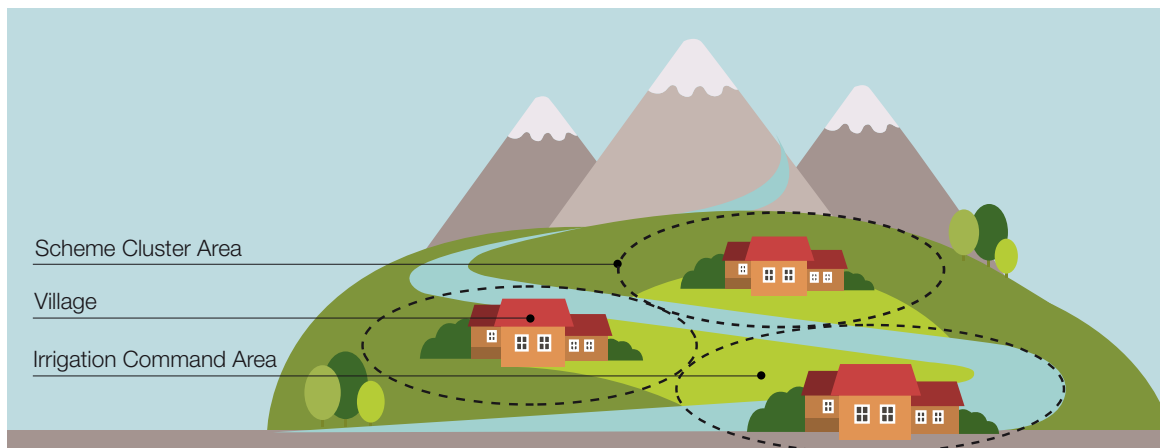
Figure 1 Schematic of PRIDE's targeting strategy in scheme cluster areas