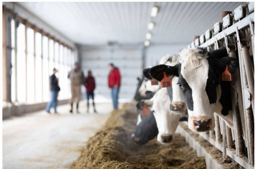
Figure 1. A Minnesotan dairy farm

USDA Census of Agriculture data ranks milk from cows as the fourth largest contributor to Minnesota's agricultural sales, accounting for 9.4 percent of the state's total agricultural products sold. ix Stearns x and Morrison xi counties in central Minnesota lead the state in