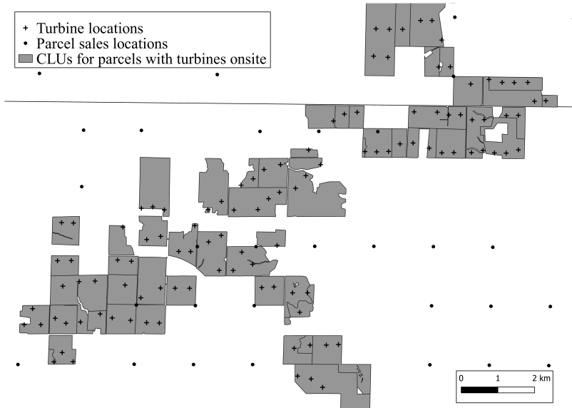
Figure 2. Sample Parcel and Turbine Locations Together with CLUs

Notes: Parcel locations are for any parcel having a sales transaction during the period of analysis and not necessarily subsequent to a turbine installation.