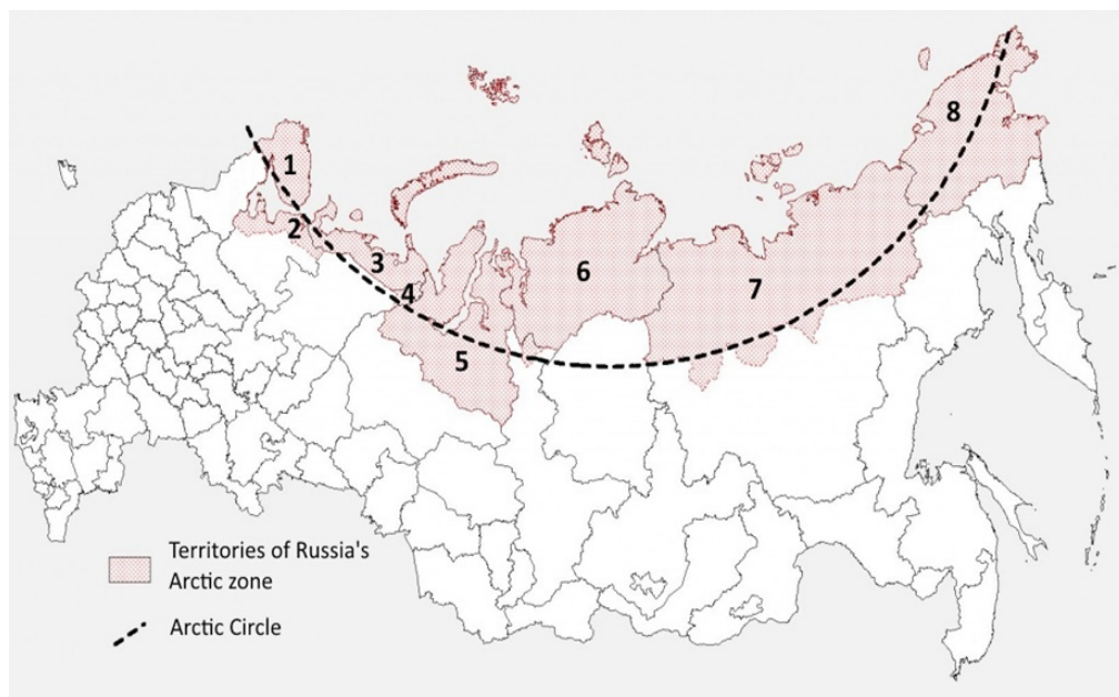
Figure 1. Territories of the Arctic zone of Russia included in the study