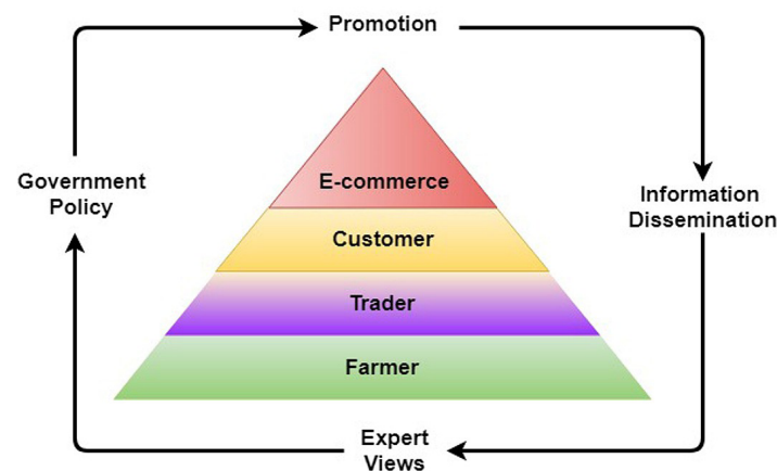
Figure 2 explains the benefits of e-commerce framework. The farmer is given the maximum priority as he sits at the bottom of the pyramid. Farmers will have information about prices, best agriculture practices, government policies etc. E-commerce will integrate traders and consumers to provide an organized market. Traders will be assisted by the trading platform to conduct trade. Finally, the consumers will have a portal that will allow them to buy the product irrespective of their geographical location. As the market reach increases there will be an increase in demand

Agriculture, with its allied sectors, is the largest source of livelihoods in India. As per the report of Food and Agriculture Organization of the United Nations, 70 percent of India's rural households still depend primarily on agriculture for their livelihood, with 82 percent of farmers being small and marginal. This is true for the community-based enterprise for Udupi jasmine growers. Therefore, the e-commerce framework will assist in integrating the rural and urban resources which will assist improving the socio-economic conditions of the growers involved in the jasmine production. In this process it will integrate information of both rural and urban market, provide guidance to market agricultural products.