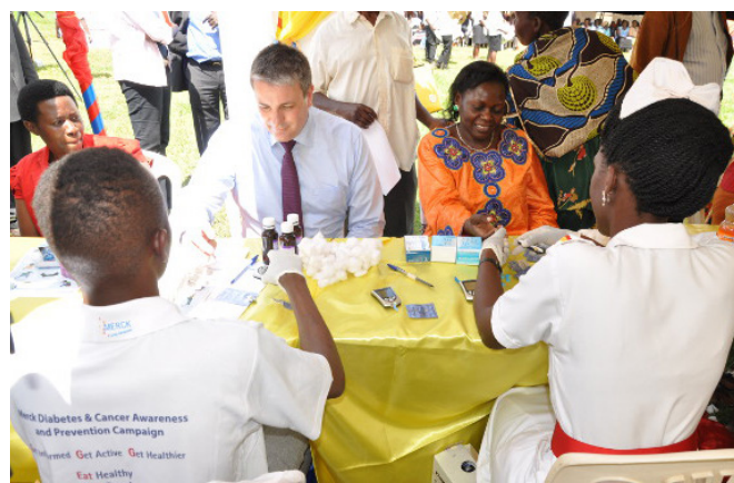
Blood pressure screening

In every 10 individuals from Karamoja, 6 are poor whereas about only 1 individual is poor in every 10 individuals from Kampala, Ankole and Central sub-regions. About 4 individuals are poor in every 10 individuals from both the Bukedi and Busoga sub-regions. Worth to note is that Bukedi and Busoga exhibit less health insurance utilisation which is combined with the highest prevalence of NCDs (Table 2). This re-affirms the need to prioritize the most vulnerable sub-regions in order to prevent the poor from becoming poorer.