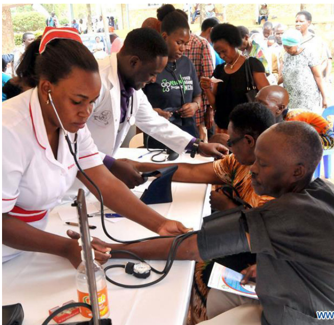
Nurse testing for blood pressure at Kawempe Hospital, Kampala