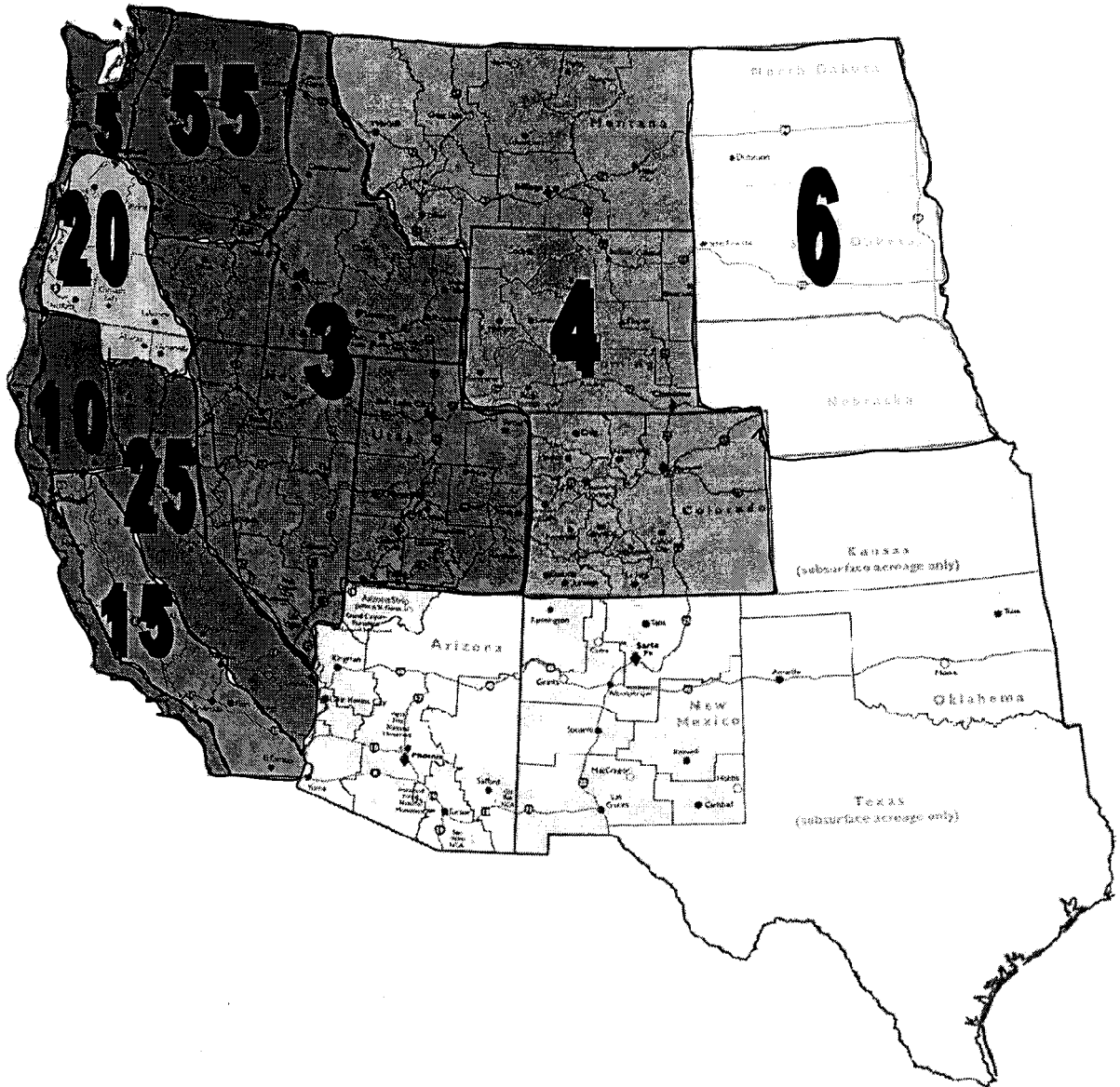
Figure 1. Market Regions