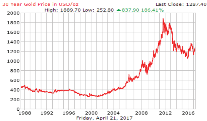
Figure 1: Trends in the price of gold last 30 years