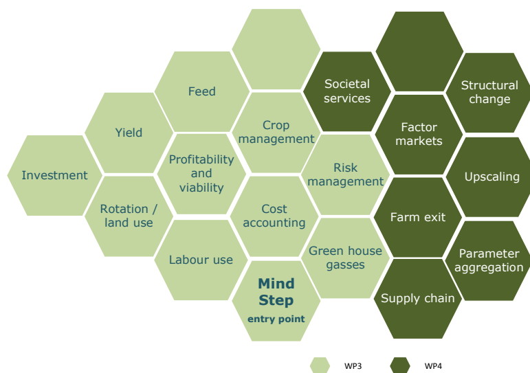
Figure 2: MIND STEP : system of interlinked models centred around individual decision making units

In WP3 the focus is on the behaviour of the individual farmer including key functionalities, while WP4 takes these single farm models and combines them with regional level models, such as ABMs, considering the interaction between farms and other actors in the agricultural food chain and non-food chain actors. The MIND STEP suite of models is a modular framework where functionality can be added with additional models and data. The system of interlinked models centred around individual decision making units is pictured in Figure 2. MIND STEP first develops an overarching IDM model that re-uses and improves existing modules. For that purposes IDM models as IFM-CAP (Louhichi et al., 2017), FES (Nowicki et al., 2009), FARMDYN (Britz et al., 2016), AGRISPACE (Mittenzwei and Britz, 2018) and the ABM AgriPoliS (Sahrbacher et al., 2014; Happe et al., 2006) are useful starting points. AgriPoliS allows to perform experiments with artificial economic agents interacting in a dynamic and spatially explicit manner, especially focussing on structural change and land markets. IFM-CAP is an EU-wide individual farm level model aiming to assess the impacts of CAP towards 2020 on farm economics and environmental effects.