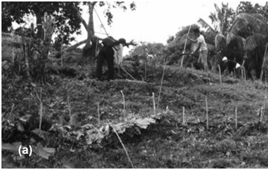
Figure 4. CCA strategies showcased in the study sites in the Philippines