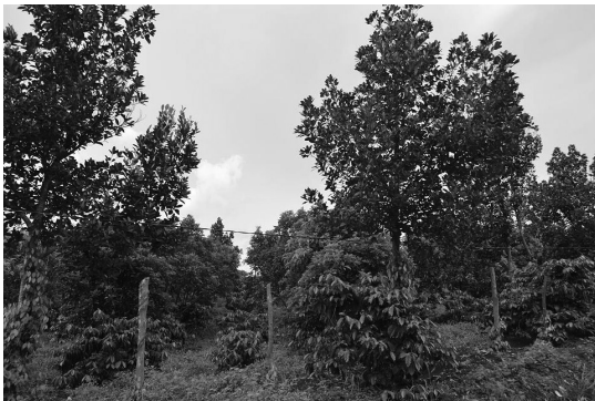
Figure 6. CCA strategy showcased in the Central Highlands of Vietnam

Notes: (a) Aqua-silviculture (b) Goat production