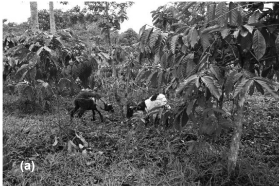
Figure 2. Demonstration plots established in Indonesia

Note: Integration of rubber, coffee, and macadamia