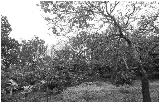
Figure 1. Demonstration plots established in Vietnam