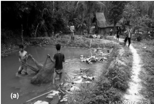
Figure 5. CCA strategies showcased in the Indonesia study sites

Notes: (a) Establishment of contour hedgerows (b) Construction of rainwater harvesting facility