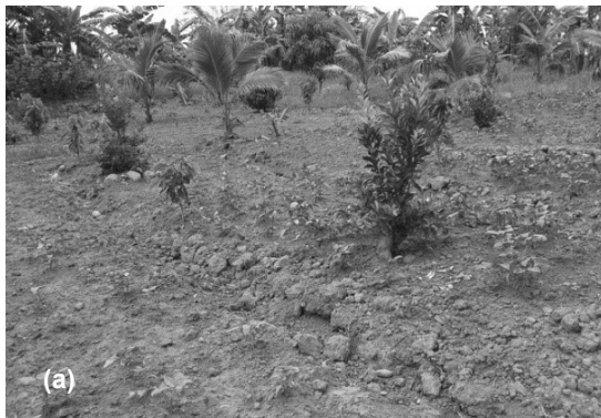
Figure 3. Demonstration plots established in the Philippines

Notes: (a) Agrisilvipasture system of agroforestry (b) Agrisilvi system of agroforestry