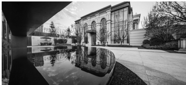
Fig. 5 Static beauty (false or true complement)

5.2.2 Light and shadow. The life track of plants can form a dynamic real scene with the participation of light and shadow. It is a kind of natural beauty, a kind of harmonious beauty, a kind of goodness and beauty. The plant landscape of the Red Star · Xintiandi Exhibition Area uses the faintness, virtual reality and movement of light perception (Fig. 5) and changes in the brightness of the light source to establish the composition of the light, making the night space environment of the exhibition area colorful and full of the times. After stepping into it, people can feel the dialogue between light and shadow, and time and space, presenting the beauty of the shadows.