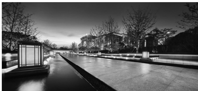
Fig. 2 Surging fountain (bringing vitality to the neat and tidy space of the venue)

4.2 Vestibule (etiquette) Water is the source of agility. Surging fountains and rows of suspended tree pools and characteristic landscape lights are like neat guard corps, creating a concierge in a multi-faceted manner. On the both sides, Ginkgo biloba L., Plumeria rubra L., Lagerstroemia indica cv "Bush", Loropetalum chinense var. rubrum , and Duranta repens cv. Dwarf Yellow are planted. Near the building of the exhibition area, Ficus benjamina L., Excoecaria cochinchinensis Lour., Rhododendron pulchrum Sweet, and Cordyline fruticosa (L.) A. Cheval. are planted. Near the enclosing wall, Fagraea ceilanica , L. chinense var. rubrum , D. repens cv. Dwarf Yellow, Syzyglum hancei Merr Et Perry, Schefflera octophylla (Lour.) Harms, Duranta repens 'Variegata' and R. pulchrum Sweet are planted. The plants planted on the both sides are uniform and varied. The end view of the vestibular space uses selected white marble walls as sight barrier. The vestibule is magnificent without losing the details, shielding all the noise off. It seems to be a prosperous world (Fig. 2).