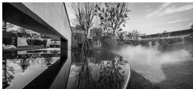
Fig. 3 Artistic conception of the reception area (rich)

(i) Cerasus sp. + Acer palmatum Thunb. + cappadocicum + L. indica cv "Bush" - D. repens cv. Dwarf Yellow + Olea europaea L. - R. pulchrum Sweet + Nandina domestica ; (ii) Araucaria cunninghamii Sweet + Acer palmatum - Phyllostachys viridis + A. palmatum Thunb. + Sapium sebiferum (L.) Roxb. + Cerasus sp. - Camellia sasanqua Thunb. + D. repens cv. Dwarf Yellow + O. europaea L. + Pittosporum tobira - Ophiopogon japonicus (L. f.) Ker - Gawl. cv. Nanus + N. domestica + R. pulchrum Sweet; (iii) A. cunninghamii Sweet + C. sinensis Pers. - Lagerstroemia speciosa + sweet tea olive + P. rubra L. cv. Acutifolia + Jatropha integerrima Jacq. - O. europaea L. + Photinia serrulata - R. pulchrum Sweet + Ligustrum japonicum 'Howardii' + Dianella ensifolia (L.) DC.; (iv) Ficus microcarpa Linn. f. + Citrus maxima (Burm) Merr. + A. cunninghamii Sweet - J. integerrima Jacq. + cappadocicum - Cycas revoluta Thunb. + Photinia × fraseri Dress + P. tobira .