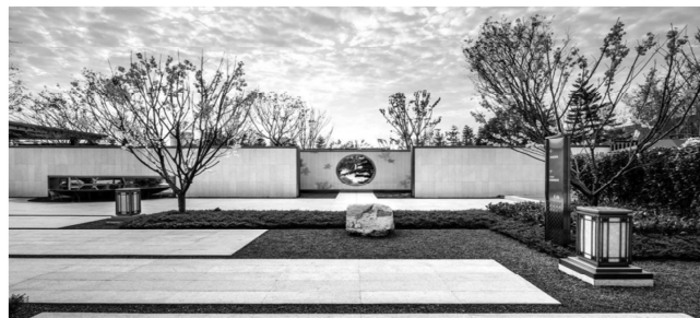
Fig. 4 Artistic conception of the courtyard (far-reaching)

4.5 Courtyard (artistic conception) There is a courtyard space with a Zen garden between the sales office and the model room. The design introduces a large amount of natural materials into the daily life space, such as stone, tree, water and light, making consumers even in a complicated city can also feel the imagery of the "nothing" in the East, the idea of "spirit", and the artistic conception of "emptiness". The courtyard is clean and leisurely (Fig. 4).