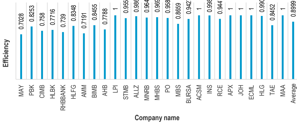
FIGURE 1. EFFICIENCY SCORE DERIVED FROM DEA