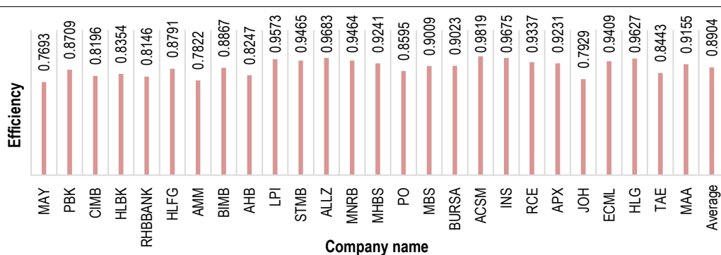
FIGURE 3. EFFICIENCY SCORE DERIVED COMBINATION OF DEA AND SFA

Source: Data from historical data of Bloomberg terminal.