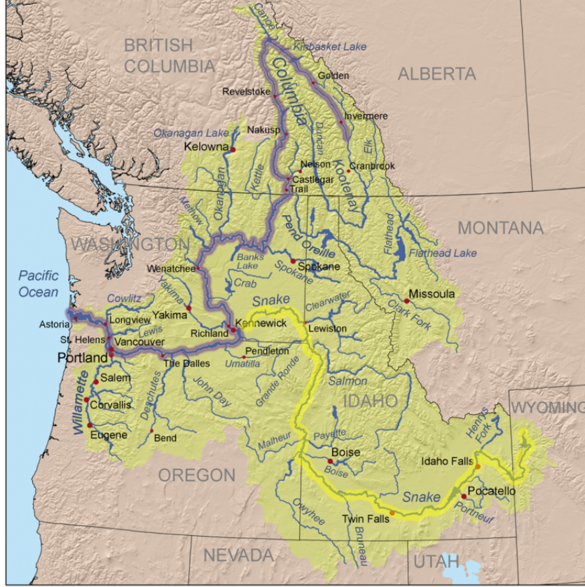
Figure 2: Snake/Columbia River

Note: The figure is available at https://en.wikipedia.org/wiki/Columbia_Basin .