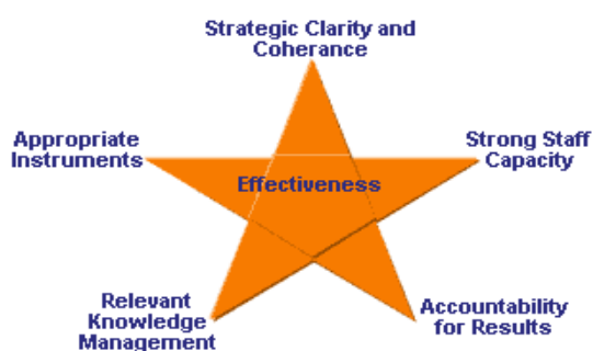
Fig. 2: Core Elements of Effective Support

The recent donor reviews conducted by CGAP partners concluded that five core elements are needed to improve the effectiveness of support for microfinance at the individual agency level. These elements also help determine a donor agency's comparative advantage in supporting financial services for the poor.