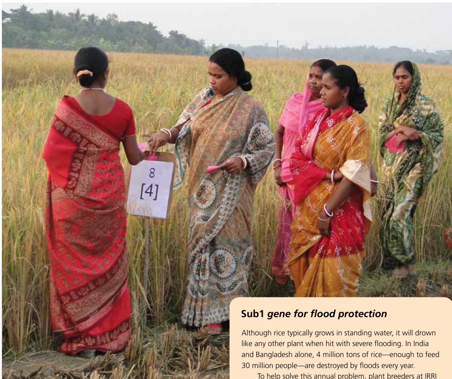
The STRASA project is helping women by providing them with flood-tolerant varieties and including them in participatory varietal selection.

It is thus important that women have direct access to good-quality seed and undergo proper training on its production, in preparation for planting in the next cropping season. Meeting the preferences of both men and women in rice varietal improvement will increase adoption rates and ensure household food security. 🌾