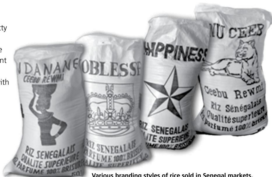
Various branding styles of rice sold in Senegal markets.

The study was conducted with financial support from Syngenta and additional funding from a Fulbright grant.