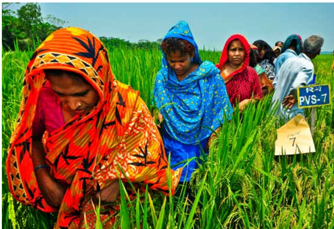
Women are now involved in participatory varietal selection.

Working with women farmers' groups has proven more effective than working with individual women farmers. In Burundi, IRRI started to work with 10 groups of ex-combatant women from the civil war by getting each group one hectare of the best irrigated land in the country and showing them how to grow rice on the land. These women received unprecedented access to farm land, farm inputs, and training to produce rice and are now building better livelihoods for themselves, their families, and communities. IRRI researchers taught the women to produce rice while NGOs provided vocational training and psychosocial support to help the women reintegrate into society. In Senegal, packaging and branding of rice helped a women's group increase the competitiveness of local rice in the domestic rice market.