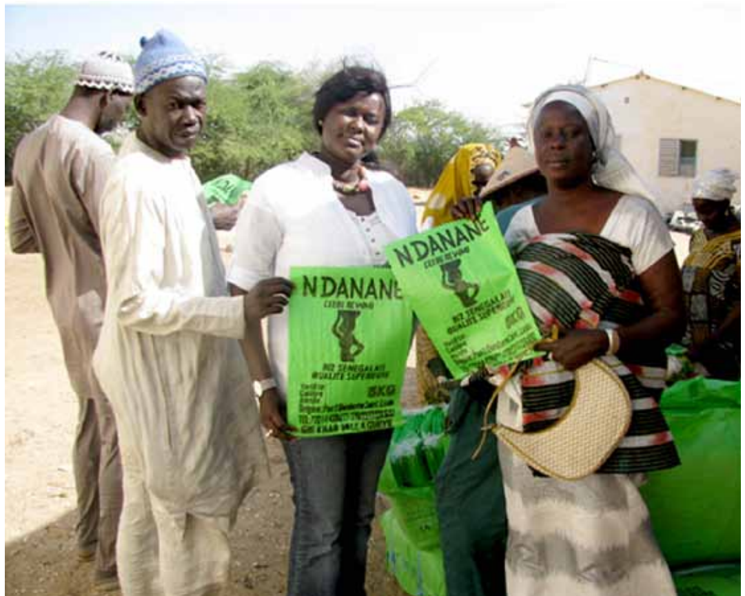
Appearances matter. Packaging helps local rice become competitive in the market.

"Marketing is an important tool in adding value to local rice in Senegal and should be used effectively as