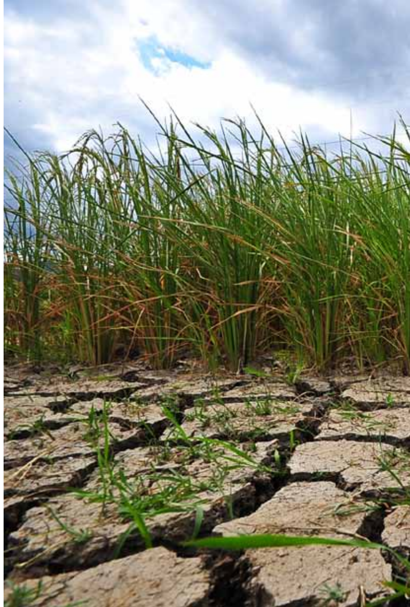
Drought-tolerant rice helps farmers cope in areas that suffer from water scarcity.

Apart from successes in the field with the introduction of the drought-tolerant high-yielding variety, women in the tribe became aware of opportunities to influence decisions made in their households and community. In addition to