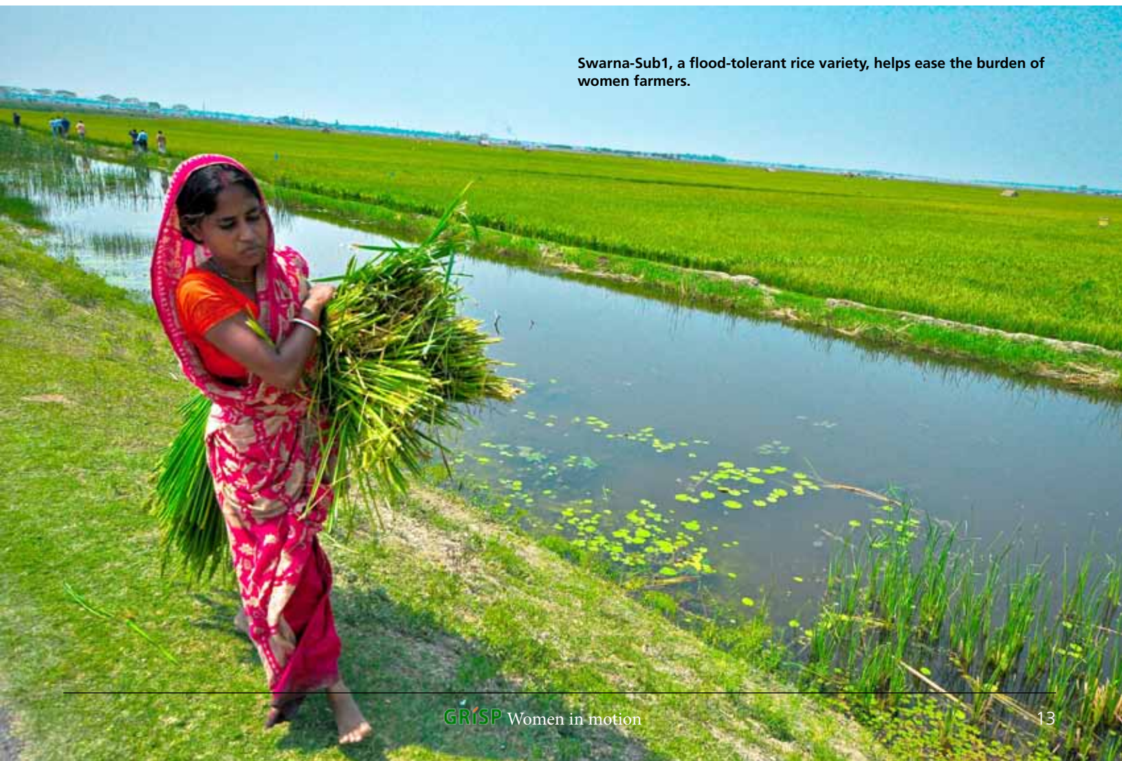
Swarna-Sub1, a flood-tolerant rice variety, helps ease the burden of women farmers.

As more men migrate to the cities to find jobs, the women are left behind to tend the farm. Not surprisingly, they are doing quite well in their newfound function. 🌾