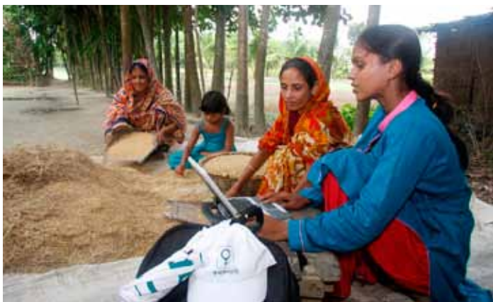
The USAID-funded CSISA project empowered young women by training them to provide ICT-based services to those who lack access to basic information on agriculture.