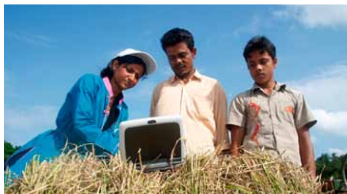
An InfoLady shares knowledge through her laptop on better harvesting techniques.

As part of GRiSP, the Cereal Systems Initiative for South Asia (CSISA) project in Bangladesh aims to tap into this