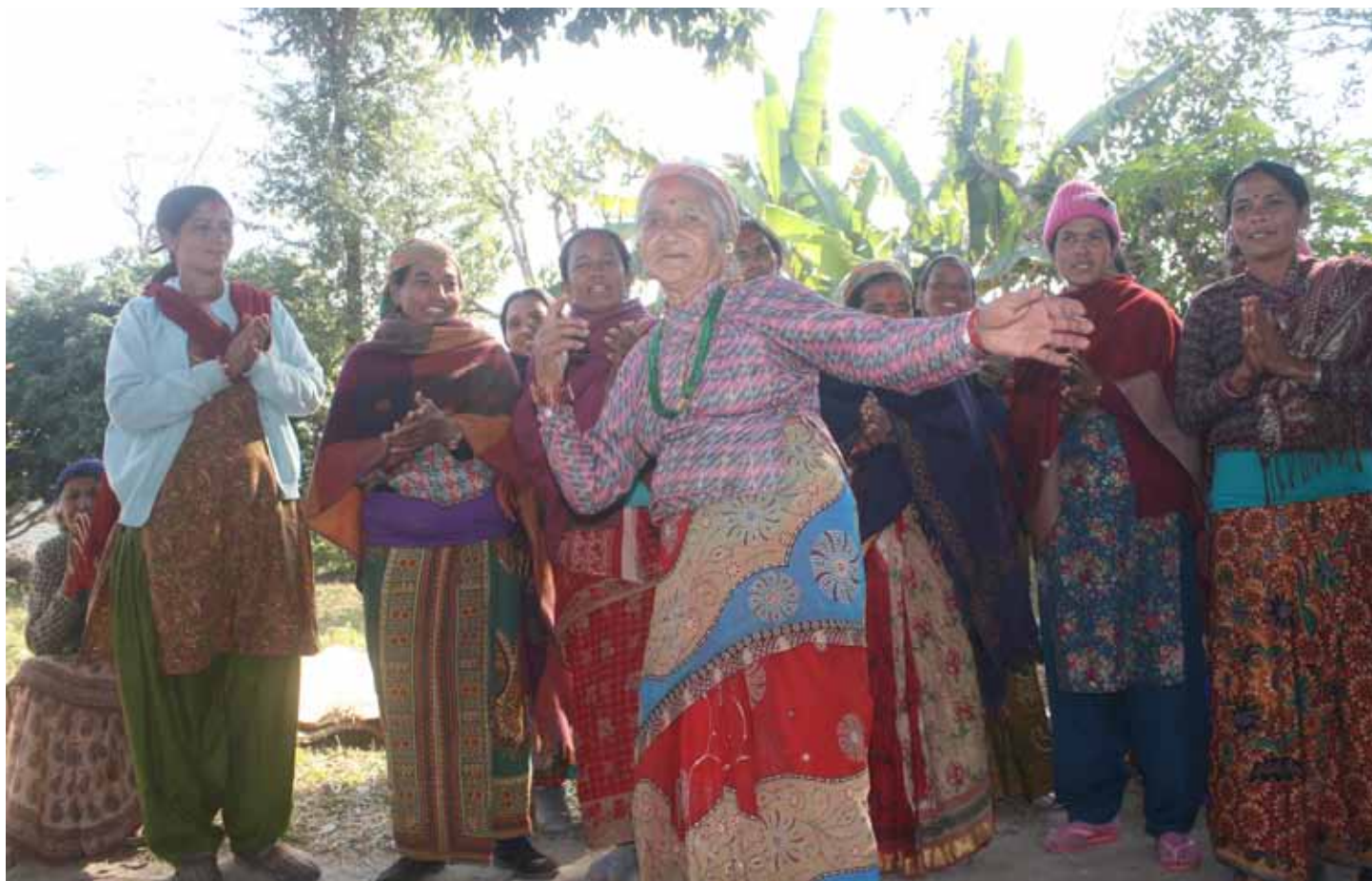
An elderly woman from the Mahjuwa Ladies Seed Producers Group welcomes visitors from the Consortium for Unfavorable Rice Environments and the Institute of Agriculture and Animal Science.

These "women of substance" are leading, influencing, and making a difference in the lives of other women and men in their respective rice-farming communities and, by these actions, are motivating other people to take on multiple roles to improve their circumstances. 🌾