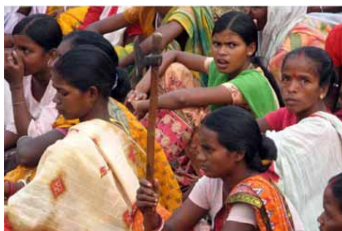
Women are partners in food production and livelihood in the community.

needing less water for the introduced variety, the tribe can also schedule vegetable cultivation on their farms because Sahbhagi dhan is a short-duration variety.