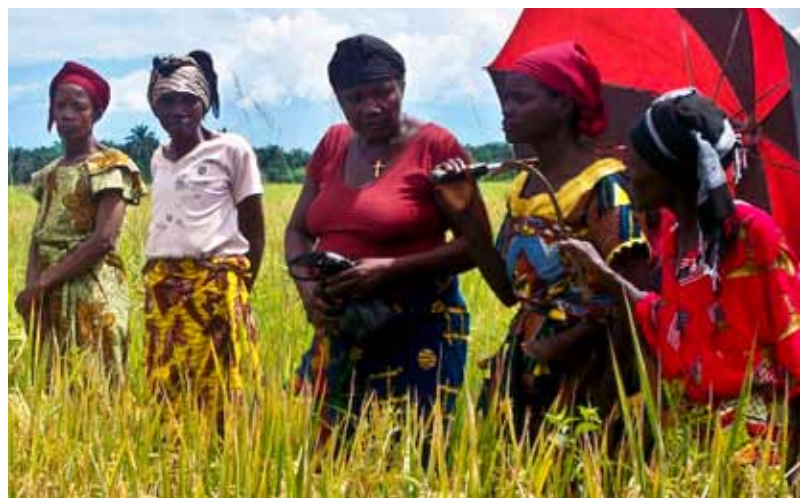
IRRI, CARE, and the Burundian government have helped women contribute to a rice self-sufficient country.

During a group interview with the women involved in the project, they all said that the most important aspect of the project was that it gave them access to land, which they would not have had without IRRI, CARE, and the cooperation of the Burundian government.