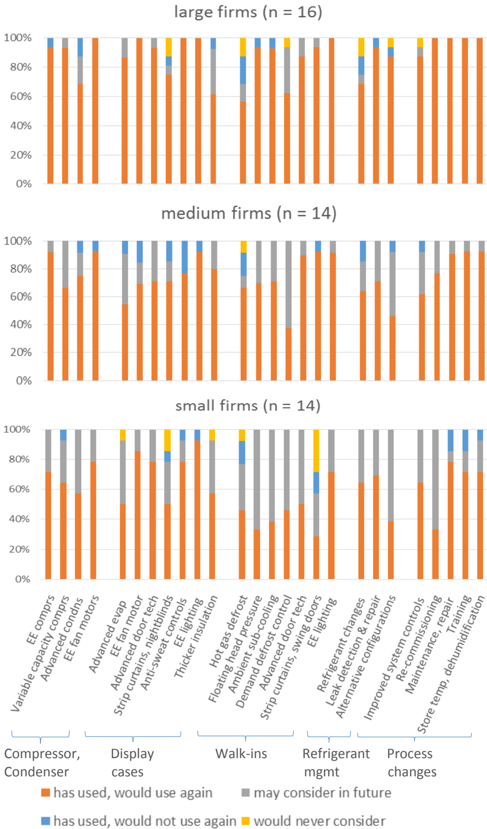
Figure 2: Participant use of refrigeration technologies, by firm size