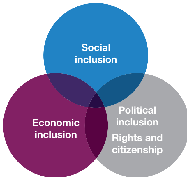
Figure 1 Inclusion: three main interrelated domains

For poor or marginalized groups, getting successfully involved in collective action increases confidence and self-esteem while improving living conditions. Organizing relies on the rationale of increasing bargaining power within the economic sphere. However, although material conditions matter, the impact of collective action is intrinsically linked with uplifting individual and social capacities to act differently and challenge the distribution of power that constrains the capabilities of poor and marginalized groups. By organizing, individuals benefit from capacity-building that increases individual and collective agency. Capacity-building goes beyond mere “skills training,” since it aims to empower people, opening up new options that were not even thought possible before.