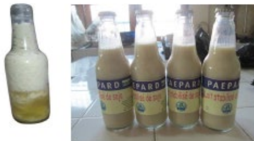
Figure 2. Status of unstabilized soy milk (left) and stabilized (right) 24 h after production

Technologies developed revealed interesting results. The technology developed in the soy milk sub-project yields 12 L of soy milk per kg of soybean as compared to 08 L of soy milk per kg soybean when using the traditional technology. In the same way, the shelf life of the stabilized soy milk is more than 6 months, whereas this was at most 24 hours with the traditional technology.