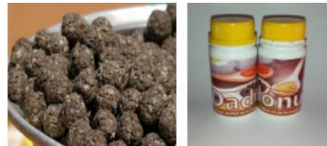
Figure 3. Soybean afitin (left) and Dadonu soja (right)

As far as the soy afitin sub-project is concerned, it was envisaged to improve the soy based-afitin product. However, soy-based afitin is not stable for long-term preservation because it is a fresh product. Moreover, Afitin alone cannot substitute commercial taste enhancers mainly because it is not able to raise the taste of foods the same way. In this regard, a soy-based recipe was produced by mixing powdered Afitin with diverse spices in order to enhance the fermented soybean cotyledons. This recipe is called 'Dadonu' which means a local taste enhancer. 'Dadonu' is mainly composed of soybean and spices.