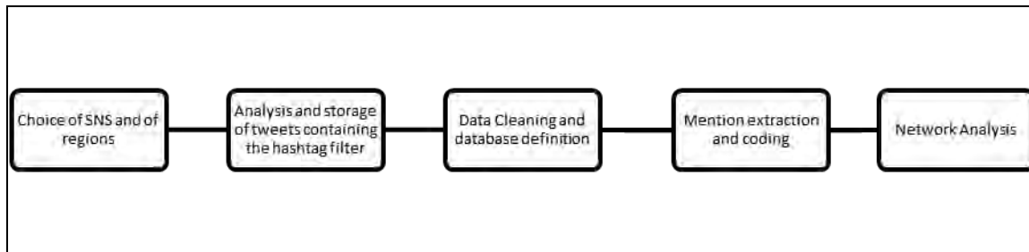
Figure 1. Overview of the research method

The starting point for the research method (figure 1) was the choice of which social platform to use in order to carry out the study.