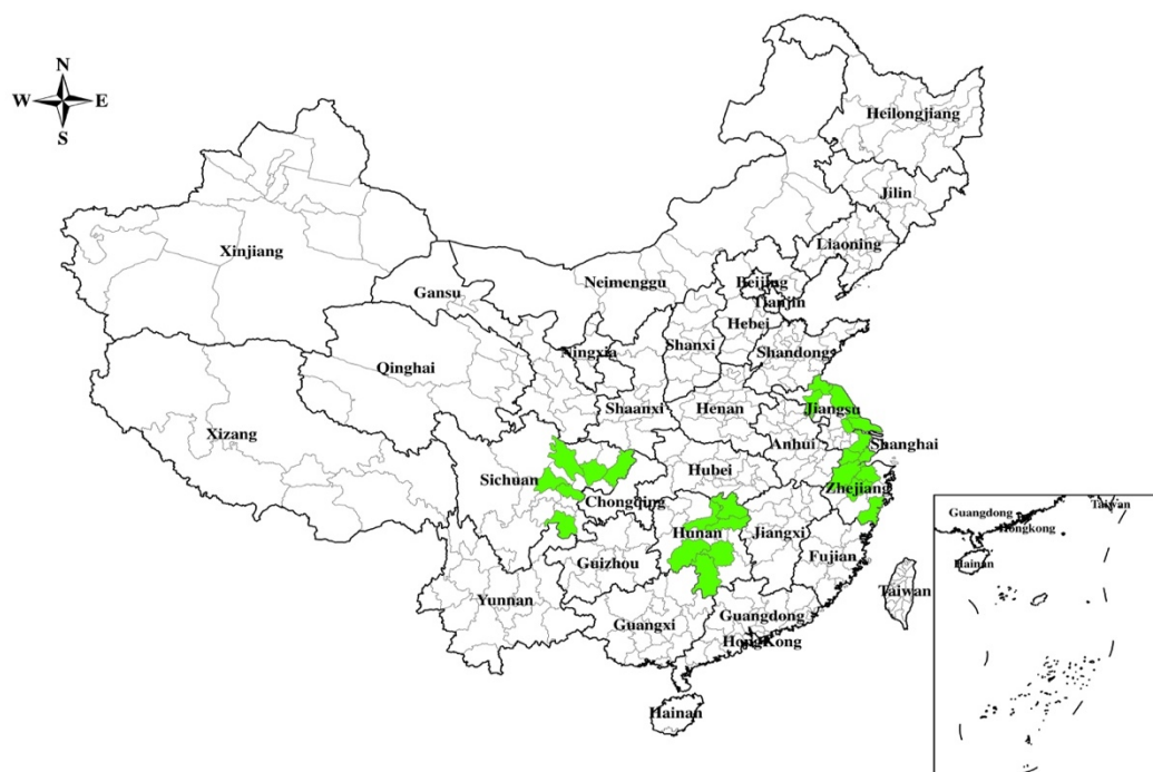
Fig. 3 Map of China and four sample provinces