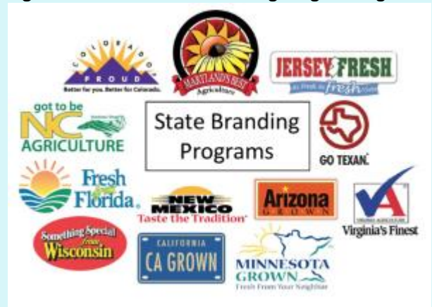
Figure 1. Selected State Branding Program Logos

These programs generally reflect the most all-encompassing definition of local, both in terms of their statewide geographic designation and the inclusion of locally processed or manufactured items in addition to items grown or raised in the state. As 90% of these programs are