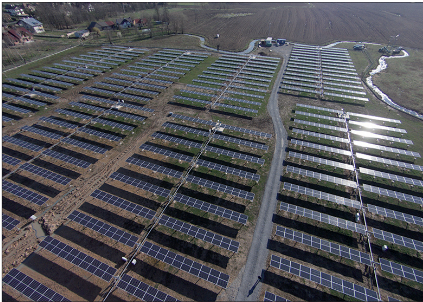
Photo 1. PV power plant in Jadowniki, Malopolskie Voivodeship, Poland.