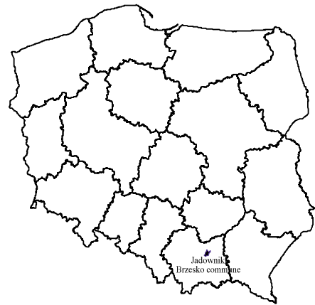
Map 2. The location of Jadowniki PV power plant in Brzesko commune in Małopolskie Voivodeship.