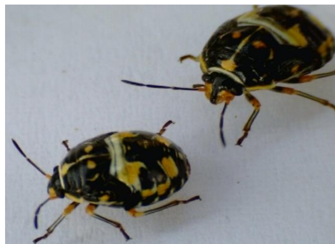
Image 1: Antestia bug, Antestiopsis thunbergii (Gremelin) (Hemiptera: Pentatomidae).

This study first evaluated the effectiveness of integrated pest management using pruning alone or in combination with several commercially available pesticides against a field population of antestia bugs. Previous research had shown that pruning was effective in reducing antestia populations because antestia prefer a shaded, damp