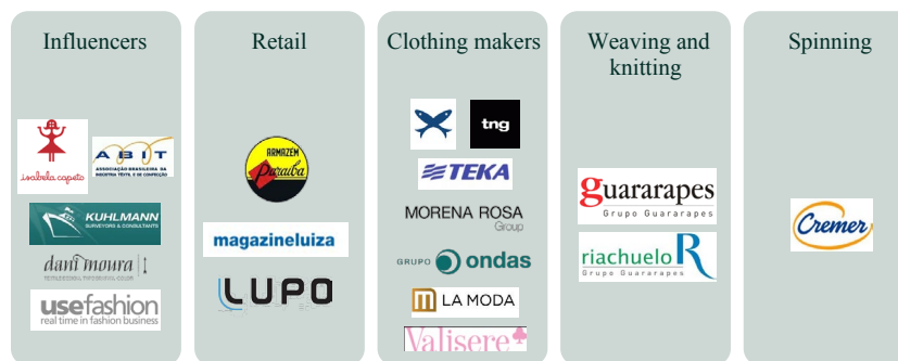
Figure 1. Participating companies in the cotton chain diagnosis.

with them to develop and create new fibers and fabrics. As a result, synthetic fibers were displacing cotton fibers at the knitting and weaving level of the value chain.