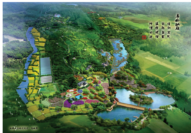
Fig. 2 Aerial view of Naya Mountain Villa

3.3.3 Effect map. The planning intention is directly expressed with an effect map, as shown in Fig. 2.