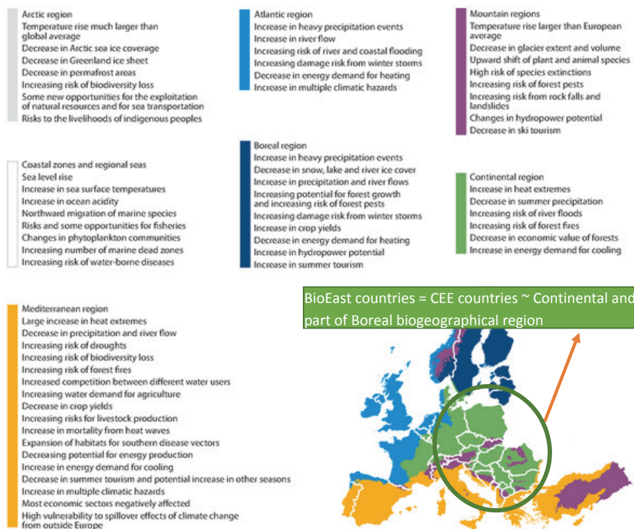
Figure 1. Observed and projected climate change and impacts for the main biogeographical regions in Europe