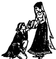
BOMBAY MERCANTILE CO-OPERATIVE BANK LIMITED

Phone: 204 9497, 204 3020, Gram: Hybridseed Tlx:011-5671 Seed-in